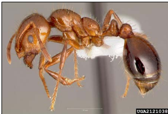
Figure 1. Fire ant worker.

Adult imported fire ants have a two-node "waist" and antennae with 10 segments, including a two-segmented club at the tip (Fig. 1). Solenopsis invicta is a reddish brown but its hybrids may be darker in color. The stinger visibly protrudes at the tip of the abdomen. Other ants in Virginia, such as the Allegheny mound ant and the Asian needle ant also have painful bites and stings. Contact your local Cooperative Extension office to have ants identified.