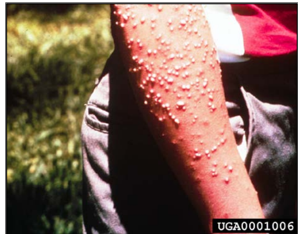
Figure 2. A badly stung arm.

Imported fire ants are quick to defend their colony by mass attack. Each ant firmly bites the skin with its strong jaws and stings multiple times as it pivots in a semicircle. Fire ant stings induce a brief but intense burning sensation, followed by the formation of fluid-filled lesions or blisters that become pustules about a day later (Fig. 2). These pustules contain yellowish fluid and resemble pimples that typically drain and scab over in a few days (Fig. 3). Fire ant venom contains toxins that produce the characteristic pustule formation as well as allergenic proteins that cause swelling and itching.