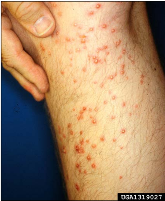
Figure 3. Fluid-filled pustules form at the sites of fire ant stings (Daniel Wojcik, Bugwood.org).

who are allergic to bee stings should seek immediate medical attention if they begin to experience breathing problems or other allergic reactions after being stung by fire ants.