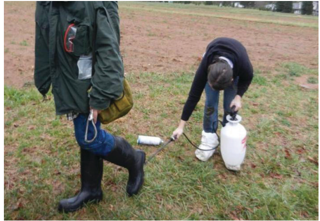
Figure 5. Clean and sanitize boots between hoop houses and productions fields.

IV. After every crop production cycle, remove all crop debris and sanitize all propagation mist beds, cutting benches, machines, and tools.