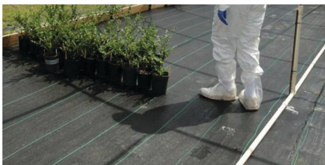
Figure 4. Store plants on easy-to-clean surface such as weed mat over well drained gravel.

and keep stock labeled so plant origin can be easily identified.