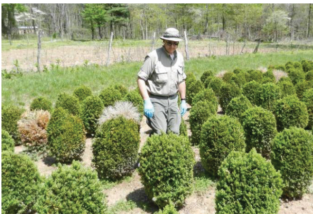
Figure 7. Scout host plants frequently.