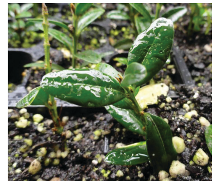
Figure 1. Take steps to reduce leaf wetness period during propagation.

d. Maximize use of drip irrigation and minimize use of overhead irrigation. Time irrigation so as to reduce leaf wetness period.