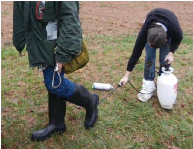
Figure 5. Clean and sanitize boots between hoop houses or display blocks.