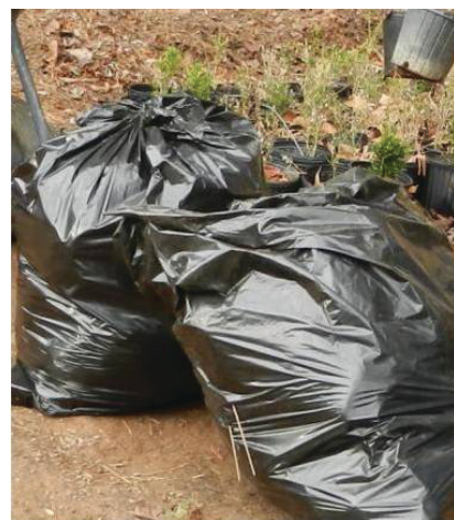
Figure 1. Infected plants should be bagged to contain leaf debris.

II. Suspend use of all fungicides during the quarantine period.