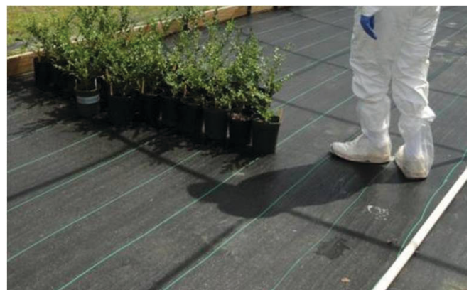
Figure 4. Store plants on easy-to-clean surface such as weed mat over well drained gravel.