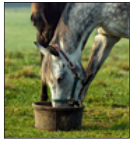
Are you hungry?

It's not all grass! Knowing what a horse eats is the first step to managing their nutrition and helping them stay healthy.