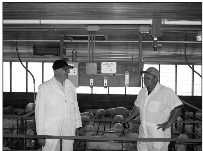
Figure 3. Open, honest, and frequent communication between the integrator's fieldman and the contract grower is essential for long-term success in contract swine production.

Respond to open communication with appropriate action. Open communication is critical, but responding to dialogue and problem identification with appropriate action is equally important. Failure to take proper