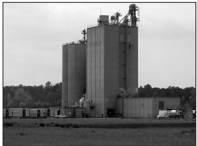
Figure 2. Operation of a large, centralized feed mill and a truck fleet for hauling feed and live hogs represents significant production costs for the contract integrator.

Therefore, the integrator must also be motivated by profit. The objective in establishing a production contract is to achieve an expected level of pig production in a cost effective manner. The integrator’s intent is to pay the grower for management and services in the production of the pigs and for the transfer of facility maintenance, mortality disposal, and manure management