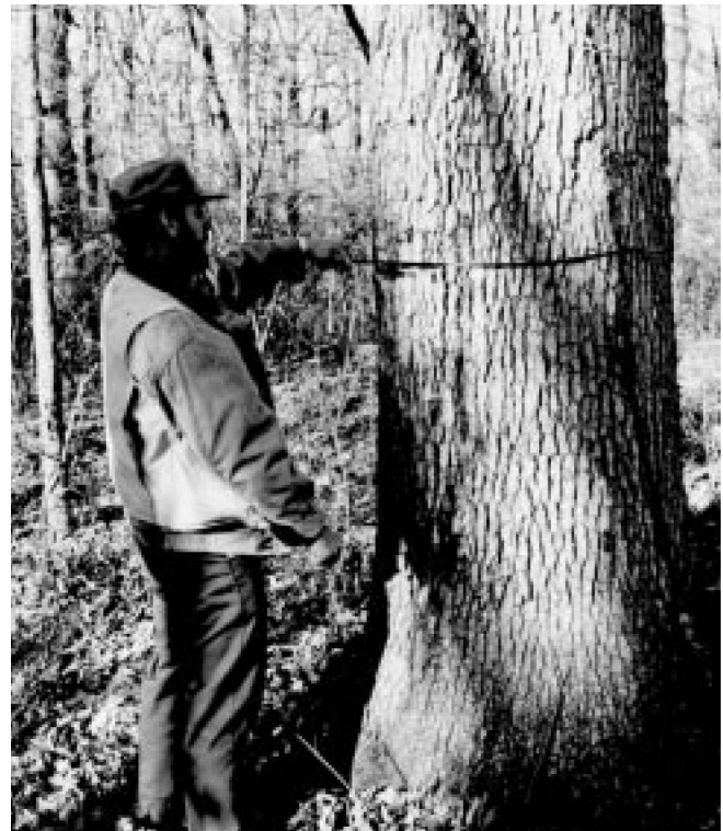
Figure 1. Forester measuring the diameter of a white oak tree using a diameter tape held at breast height, or 4 1/2 feet from the ground (Photo by R. Griffiths).

Buyers of timber will always need to conduct a survey of your woods before they can make an offer. This survey is often called a timber cruise and involves a series of measurements of individual trees, as well as