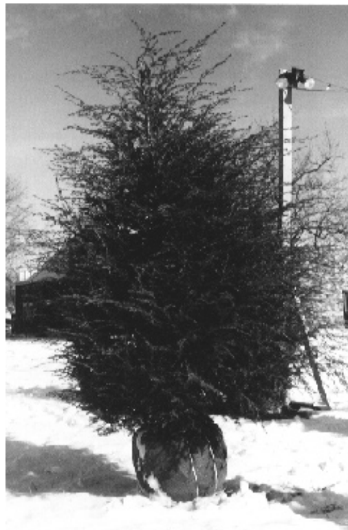
Living Christmas trees provide the added advantage of a landscape tree after Christmas.

Living Christmas trees are unique and should definitely receive special care. Since the root balls are often heavy and cumbersome, it is important that they are not mistreated or dropped. Balled and burlapped trees should not be carried by their stems, because the weight of the root ball can exert pressure on the roots and break them. It is best to pick the tree up by the ball itself or to roll the ball along the ground.