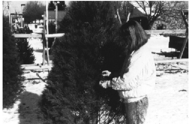
Checking a live tree on a retail lot for freshness.

It is very important for consumers to be able to tell whether or not a tree is fresh. In general, each tree should have a healthy, green appearance without a large number of dead or browning needles. Needles should appear fresh and flexible and should not come off in your hand if you gently stroke a branch. A useful trick is to lift a cut tree a couple of inches off the ground and let it drop on the cut butt. Green needles should not drop off the tree. A few dried, inner needles may fall, but certainly the outer, green needles should not be affected.