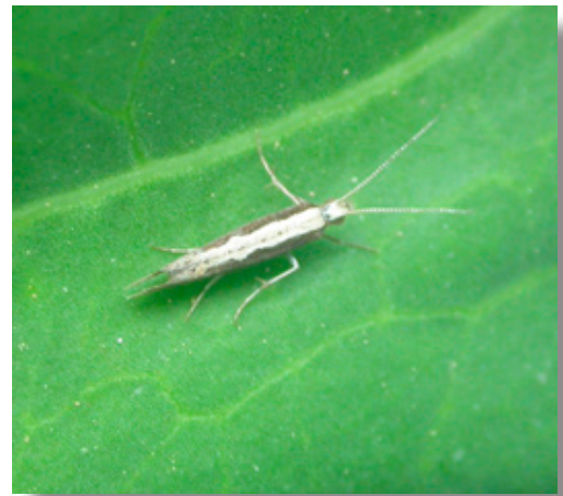
Fig. 5. Diamondback moth adult.

A high percentage of DBM are killed during periods of heavy precipitation from disease and dislodging from