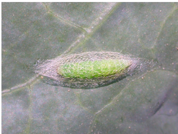
Fig. 4. Diamondback moth pupa.

Adult. The DBM adult is a 6 mm long, slender, grayish-brown moth with pronounced antennae (Fig. 5). The moth is marked with a broad cream or light-brown band along its back that is sometimes constricted to form one or more light-colored diamonds on the back, which is the basis for the common name of this moth. Adults can live for seven or eight weeks, but the usual life span is around two weeks. Mating occurs on the day of emergence. A single female usually lays from 18 to 356 eggs.