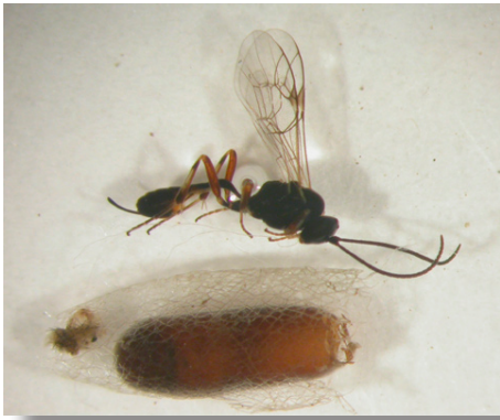
Fig. 6. Diadegma insulare , a parasitoid of DBM larvae.