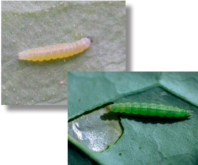
Fig. 2 & 3. Diamondback moth neonate larva and late-stage larva.