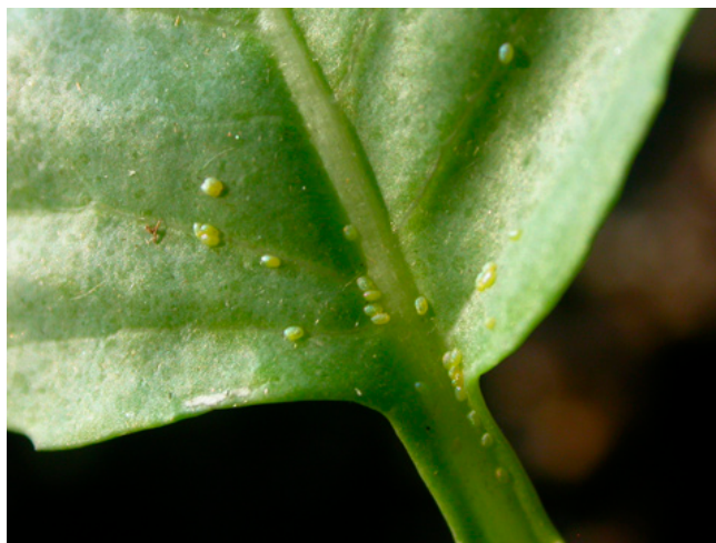
Fig. 1. Diamondback moth eggs.

The Diamondback moth (DBM), Plutella xylostella (L.), is considered to be the most destructive insect pest of crucifer crops worldwide. DBM larvae feed on leaves of crucifer crops such as cabbage, broccoli, cauliflower, collards, kale, kohlrabi, Chinese cabbage, and Brussels sprouts. All plant growth stages from seedling to head are susceptible to attack. DBM larvae can reach high densities and cause substantial defoliation as well as contamination and malformation of heads in cabbage, broccoli, and cauliflower. The absence and reduction of effective natural enemies, especially parasitoids, as well as insecticide resistance, contribute to the status of DBM as a pest.