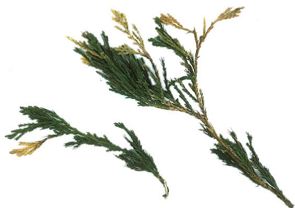
Kabatina tip blight on juniper.

Kabatina juniperi produces its spores in the fall, but symptoms do not appear until late winter or very early spring (Fig. 3). Unlike Phomopsis juniperovora , Kabatina juniperi infects through wounds caused by insects or mechanical damage. It does not invade healthy twigs.