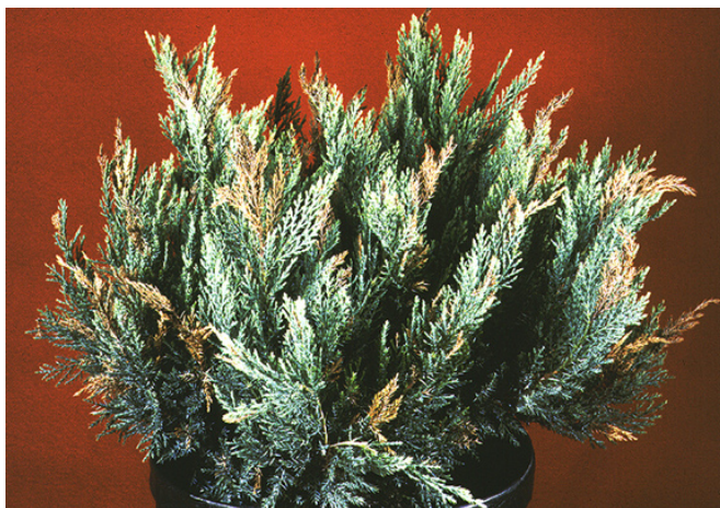
Fig. 1. Phomopsis tip blight on juniper.

Visible symptoms include browning and dieback of young needles and shoot tips (Fig. 1). Gray lesions usually girdle the shoot at the base of the dead tissue. Tiny, black or grayish fungal fruiting bodies may be visible in the gray lesions. On highly susceptible hosts, the fungus may invade and girdle larger stems, resulting in browning and death of major branches; however, this degree of disease severity is rare. Both Kabatina tip blight and Phomopsis tip blight are most damaging on younger plants.