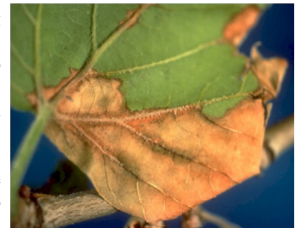
Fig. 1. Blighting of leaf tissue caused by the sycamore anthracnose fungus.

and killing of single leaves or leaf clusters may occur as the leaves expand. The disease continues to develop later in the season, resulting in irregular brown to nearly black, dead areas between or along the main leaf veins and extending to the margin (Fig. 1). Infected leaves fall when the petiole is girdled or when several lesions enlarge and coalesce to form large, dead blotches. After defoliation from spring infections, the tree may appear bare except for tufts of leaves at branch tips. Regrowth appears by midsummer. Sunken cankers form on larger twigs during cooler weather in fall, winter, and spring (Fig. 2). Twigs may die as a result of canker formation.