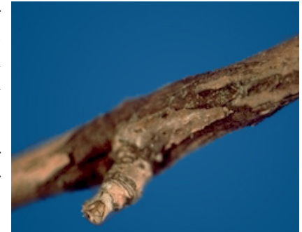
Fig. 2. Twig canker caused by the sycamore anthracnose fungus.

When terminal twigs are killed, lateral twigs take over as leaders. Thus, repeated twig dieback results in the formation of crooked branches.