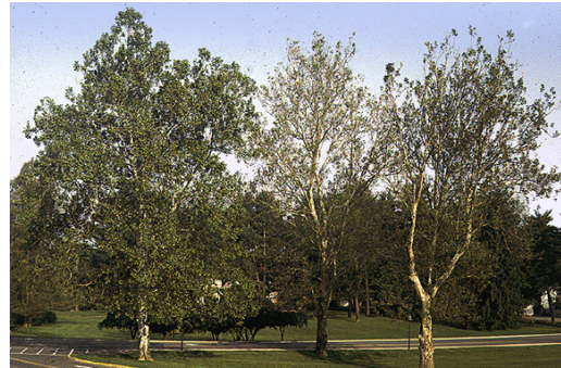
Fig. 5. Two trees on right showing symptoms of sycamore anthracnose compared to tree injected with Arbotech 20-S fungicide on left.

Disease control measures for different trees vary slightly because the period of infection is different depending on the fungal species involved. If fungicides are used, sprays must be applied on a preventative basis, beginning before infection takes place. Spraying large trees for many anthracnose diseases may be impractical and unnecessary, especially in dry springs. Sanitation is important in reducing the amount of fungal inoculum available for new infections. For large, high-value sycamore trees, injection with the fungicide, thiabendazole hypophosphite (e.g. Arbotech 20-S), on a 3-year basis is also an option (Fig 5).