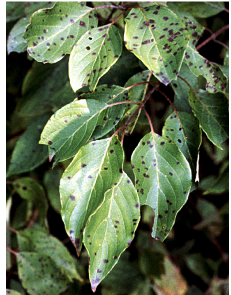
Fig. 7. Leaf symptoms of Septoria leaf spot.

Septoria leaf spot, caused by the fungus Septoria cornicola , is a late-season disease of dogwood that is little cause for concern. Angular, dark brown leaf spots with purplish margins, bordered by leaf veins, are typical