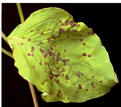
Fig. 2. Symptoms of spot anthracnose on leaves of flowering dogwood.