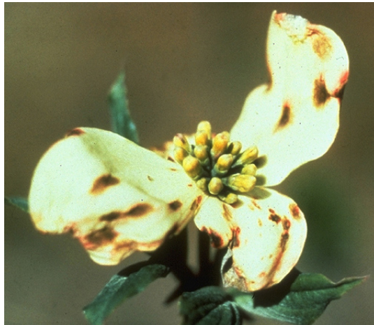
Fig. 3. Symptoms of Discula anthracnose on bracts of flowering dogwood.

3 and 4). Margins of spots are purplish in color. Spots often coalesce and blight large portions of the leaf, and affected leaves cling to the tree over the winter. The fungus moves from the petioles into small twigs and then larger branches, causing dieback. Lower branches usually die first, and in the final stages of disease, only a few green branches may be left at the top of the tree (Fig. 5). Infection may proceed to the trunk where cankers can cause death of the tree (Fig. 6). The fungus can also invade the trunk directly through succulent water sprouts (young shoots that form directly on the trunk). Water sprouts are very susceptible to infection by the fungus.