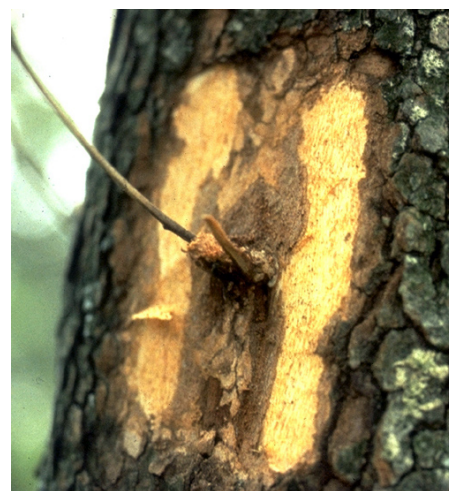
Fig. 6. Trunk canker caused by Discula destructiva .