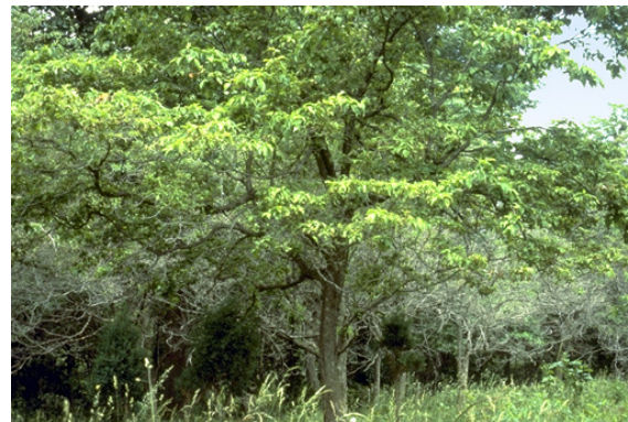
Fig. 5. Lower branch dieback due to Discula anthracnose .

Avoid planting dogwoods in sites where leaves will remain wet for long periods of time. Sites along streams, lakes, or ponds, or areas where fog tends to collect are prime sites for disease development and should be avoided. The disease is more of a problem in shaded locations; thus, planting in sunny locations can help to prevent disease. Although dogwood is naturally an understory tree, trees that are properly cared for can do well in full sun. Trees should be mulched to a depth of 2-4 inches to help conserve soil moisture. Place mulch in a donut-shaped ring around the tree instead of piling it against the base of the trunk. Placing mulch in contact with the trunk causes bark to remain moist and become more susceptible to