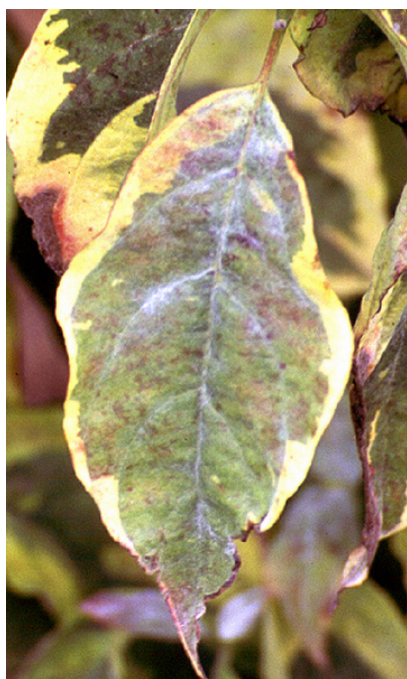
Fig. 8. Powdery mildew on leaves of flowering dogwood.

Mycelium of the powdery mildew fungus grows on leaf and bud surfaces, and appears as a white coating on these plant parts (Fig. 8). In the early stages of infection, the white fungal growth may be subtle and difficult to see; however, symptoms of infection can be severe. Leaves may be stunted, reddened, and curled or puckered by mid-season. Affected trees