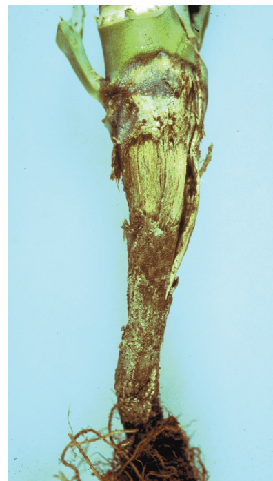
Fig. 1. Wire stem symptoms on lower stem of broccoli plant.

Wire stem gets its name from symptoms that occur on the stem at the soil level. A dark, watersoaked lesion initially appears on the stem. Later stems become wiry and slender at the point of the lesion. Diseased crucifer plants transplanted to the field grow poorly, are stunted, and may eventually die, especially if there is inadequate moisture shortly after transplanting. If infected plants remain alive, the stem becomes tough and woody (Fig. 1). Plants that survive usually mature late and fail to produce a marketable head.