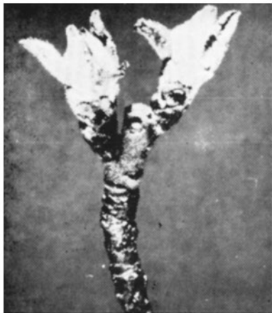
Delayed-dormant (1/2-in. green)