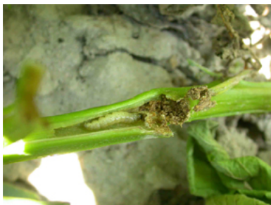
Fig. 1. ECB larvae tunneling in plant stem.

In summary, we conclude that O. nubilalis females primarily (>93% of the time) oviposit on the undersides of leaves on pepper plants, but with no apparent preference for vertical region on the plant. An egg sampling strategy for O. nubilalis in peppers should concentrate on the underside of leaves on all regions of the plant.