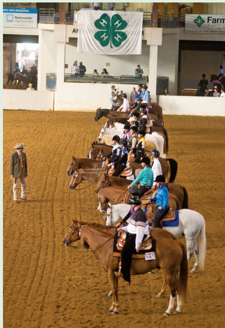
Lexington Horse Center; 4-H horse show.

We, too, would like to express our appreciation to the funders of our scholarships, who make possible initiatives such as the Adranetta Weimer 4-H Incentive Fund, Connie Collier 4-H Scholarship Fund, Farm Credit Associations and Regions Banks Scholarship Fund, Virginia AGvocates Scholarship