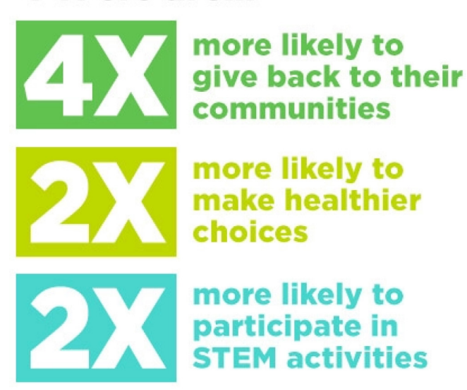
Figure 1. Ways 4-H benefits young people.