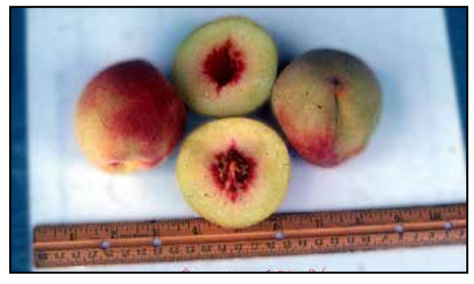
The variety is 'Rio-Oso-Gem'. The fruit on the right shows a lopsided suture.

Rich May - A recent introduction from Zaiger Genetics, Modesto, CA. Trees often produce few blossoms and cold hardiness is questionable. Trees usually produce light crops that rarely need thinning. Harvest season begins from June 19 to June 28. Fruit are round and large (2.5 to 2.75 inches in diameter) for an early variety, and there is little pubescence. Seventy to 95% of the surface is colored