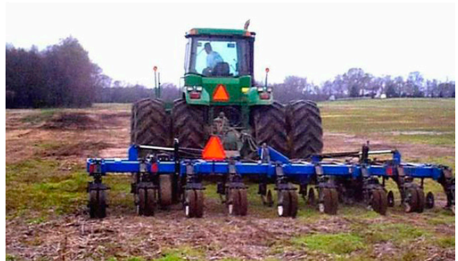
Figure 2. Deep tillage using a no-till ripper. Note the minor soil disturbance and large amount of residue remaining on the soil surface.

by animals when estimating the residue cover required to prevent erosion.