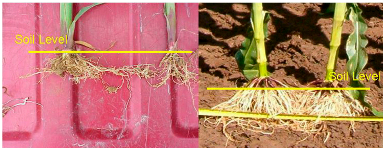
Figure 1. Corn root growth limited by soil compaction (left) and healthy roots from noncompacted soils (right).

about 50 percent of the total soil volume while soil particles make up the other 50 percent. However, this can change dramatically as soil particles are pressed together and the air is squeezed out. Generally, the largest spaces are eliminated first, taking away the path of least resistance for air and water movement as well as for root penetration. Soils with a mixture of textures (some sand, silt, and clay) are more susceptible to compaction than those with homogenous texture, when exposed to the same compactive force.