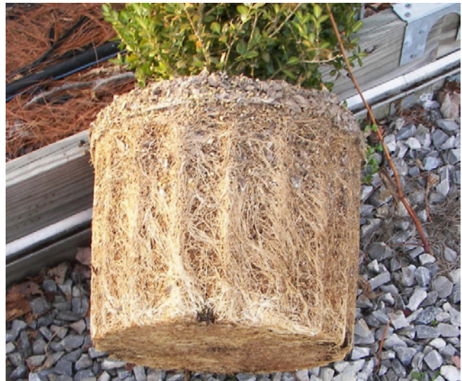
Example of a root-bound, container-grown plant. Notice how roots completely encircle and cover the exterior of the root ball.

Most shrubs are sold as container-grown plants and a small percent of shrubs are sold as ball and burlap (B&B) plants. When purchasing a container-grown plant, make sure that the plant is not root-bound (a condition when the plant has stayed in the container too long and the soil ball is composed of a solid mass of roots that often encircle the root-ball (see photo). You can plant a container-grown plant most of the year but the best time to plant is in the spring and fall.