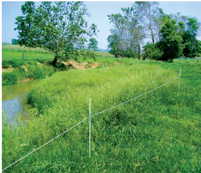
Figure 7. Polywire fencing, Rockingham County, Virginia.

Every livestock stream exclusion system will be unique. Livestock comfort and controlled movement must be a consideration when designing any system. It is possible to have multiple design and component combinations— studies have shown that off-stream watering without fencing can be an effective management tool in some areas 14, 20, 22, 45, 64 ; other areas may only need a fence where an alternative source of water is already available; and many areas will likely need a combination of a fence and off-stream watering supply. One should also determine whether supplemental shade and/or hardened crossings are needed.