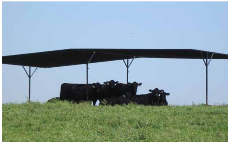
Figure 3. Portable shade structure, Bedford County, Virginia.

To maintain highly productive livestock, or to lure animals away from streams where streamside exclusion fencing is not installed, salt blocks, scratching posts, dusters, windbreaks, shade, and other shelters should be located away from the stream as much as is practical without producing excessive travel distances 2 and not in the same location as waterers 3 .