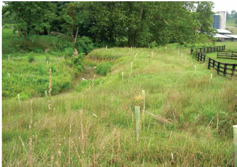
Figure 6. Riparian buffer, Augusta County, Virginia.

Studies have shown a 30-95% reduction in pollutants when runoff passes through a buffer strip 1 .