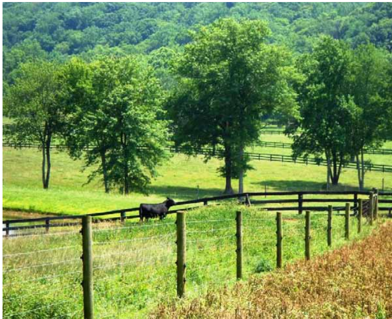
Figure 1. Controlled grazing paddocks in Fauquier County, Virginia