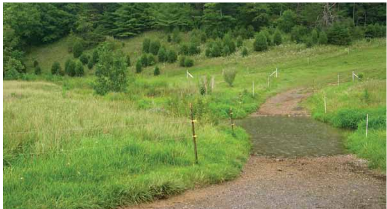
Figure 5. Example of hardened stream-crossing, Augusta County, Virginia.

When pasture is present on both sides of a stream, it may be necessary to install a hardened crossing to allow cattle to move between pastures while restricting access to the stream. The width of hardened crossing is typically limited to discourage cattle from loitering in the stream. However, NRCS guidelines require a six feet minimum width for cattle crossings and 10 feet for vehicular crossings 52 . A fenced lane may also require additional maintenance, as debris can get trapped during high flows and the fence may be damaged during flood events 2 . The most common fencing losses due to flooding reported by the producers interviewed occurred at stream crossings. Restricted stream access and hardened crossings protect riparian areas while still allowing livestock to water from the stream.