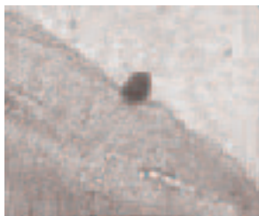
Figure 1. Trophont