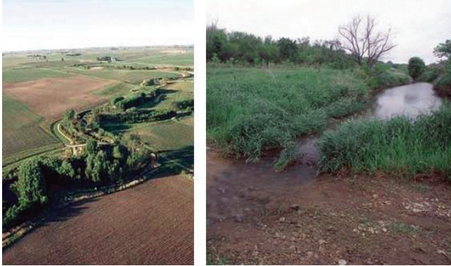
Figure 2. Left , forested riparian buffer; right , vegetated buffer.

The area contributing runoff or subsurface flow, often called the contributing area, is an important consideration when sizing a buffer. Large contributing areas often contribute more flow than smaller contributing areas and thus require a larger buffer area for adequate treatment.