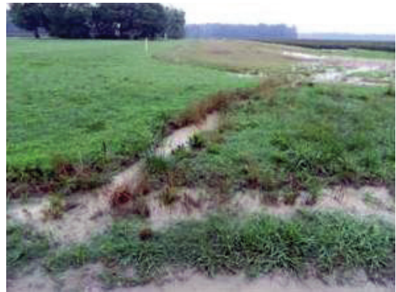
Figure 3. Some practices, such as cutting a ditch through a buffer, can render the buffer ineffective.