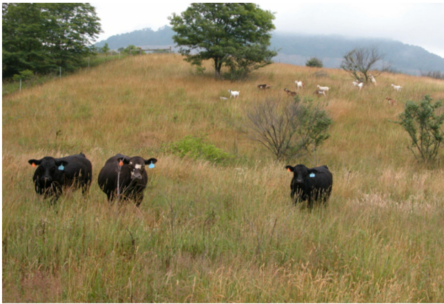
Figure 1. Mixed grazing of cattle and goats, Powell River Research and Education Center project site, Wise County, Va.

animal performance. The three treatments included an ungrazed control, cattle grazing alone, and mixed grazing goats with cattle (figure 1).