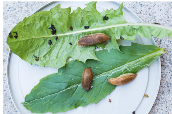
Figure 1. Dusky slugs ( Arion subfuscus ) collected from Blacksburg, VA.

Sweet corn ('Applause') was planted no-till on 19 May, 2015 into a heavy residue of late killed annual rye at Virginia Tech's Kentland Farm. On 29 May, slug baits were applied into individual plots of seedling corn three rows wide by 20 ft long. Treatments included: Deadline MP 20 lb/a, Deadline GT 13.3 lb/a, Iron Fist 10 lb/a and a control of cat litter @ 10 lb/a.