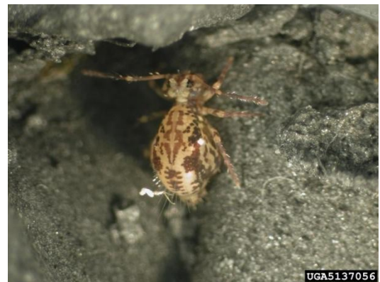
Sminthurid collembola

Interesting Facts Springtails have a forked appendage at the tip of their abdomens that they can release to catapult themselves through the air, which is how they get their common name.