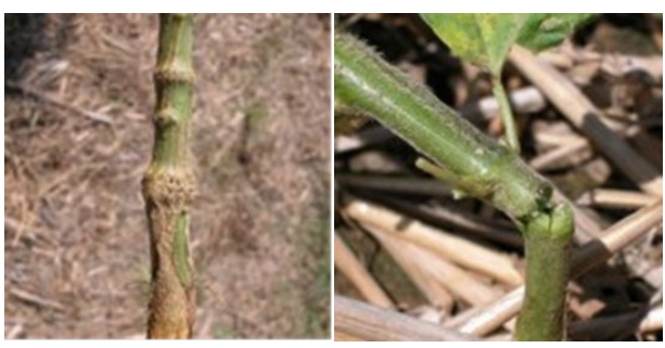
Figure 3. Girdling and breakage in soybeans as a result of injury from nymphs and adults (Stewart et. al 2017).

Threecornered alfalfa hopper has piercing-sucking mouthparts and feeds on phloem in the stem of plants less than 30 cm tall. Prolonged feeding may result in plant death or a girdle that can cause the plant stem to break before harvest (Fig. 3). Girdling can cause the plant stem to weaken and break during windy conditions. Additionally, girdling restricts the transport of nutrients and can lower grain yield on affected plants (Reisig 2021). Girdling of additional structures (e.g. petioles and peduncles) do not cause yield loss.