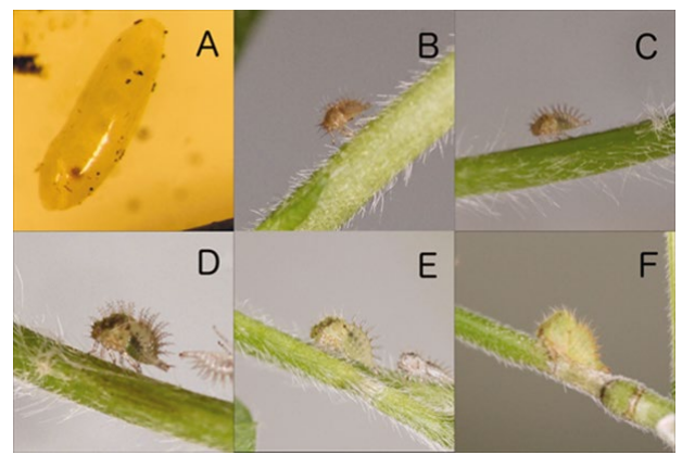
Figure 1. Egg (A) and nymphal growth from hatching to final instar (B-F) (Beyer et al. 2017).

Adults maintain the same wedge shape as the nymphs and are green. Adults range in size from 6-6.5mm. Adult females are larger than males, and males have a red/orange stripe running along its top (Fig. 2) (Beyer et al. 2017).