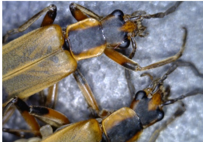
Fig. 2. Margined leatherwing beetle