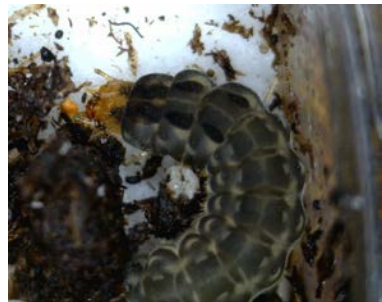
Fig. 4. Margined leatherwing adult feeding on pollen in the spring (A), eggs laid in the soil (B), neonate larvae (C), 2 nd instar larvae (D), velvety black late instar larva (E), and larva devouring insect prey (F)