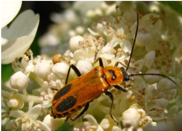
Fig. 1. Pennsylvania leatherwing beetle

Beetles in the family Cantharidae are referred to as soldier beetles or leatherwings. The name soldier beetle originates from the elytra (front wings) of one of the earliest described species being reminiscent of early uniforms of British soldiers. The latter name was coined for the soft nature of the elytra. Two species in the genus Chauliognathus are commonly found in Virginia. Chauliognathus pennsylvanicus (Fig 1) is often referred to as the Pennsylvania leatherwing, or the goldenrod soldier beetle referring to its favorite flowering plant in the fall. A similar species Chauliognathus marginatus , the margined leatherwing, is found in the spring on various flowers.