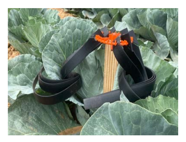
Figure 4. MESO pheromone dispenser in a cabbage field.

From 2021-2023, DBM mating disruption experiments have been conducted on commercial brassica farms in Virginia. In each location, we divided experimental fields were divided into treatment vs. control. The treatment fields received solid MESO pheromone dispensers (Fig. 4) following manufacturer proposed rate. In every field, three PHEROCON® baited sticky traps were placed to monitor and assess adult moth activity. Leaf damage and larval presence was also assessed weekly.