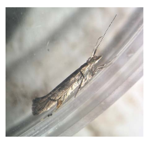
Figure 3. DBM adult moth. About 1 cm long.