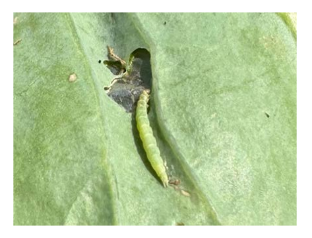
Figure 1. Late instar DBM larva feeding on green cabbage leaf.

Adults are small, ~9 mm in length (Fig. 3). They are grayish brown with a distinct white diamond pattern on their wings when folded. The life cycle from egg to adult is around 21 days during the summer, and they can have numerous generations per season. One adult female moth can lay up to 300 eggs in her lifetime.