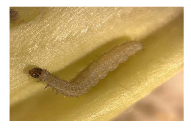
Figure 2. DBM neonate larva.

developed resistance to > 100 different insecticides globally, making it the hardest to kill lepidopteran pest in the world. Therefore, alternative pest management techniques such as mating disruption are needed to help resistance management.