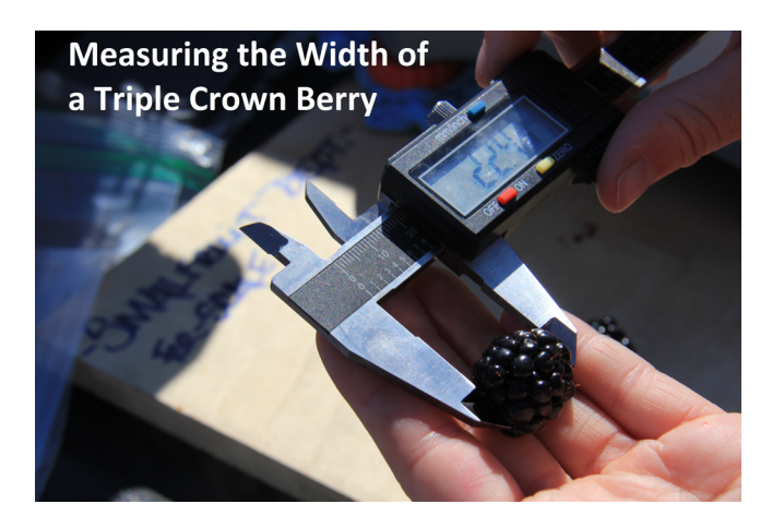
Figure 4. The size of fruit was measured with a vernier caliper scale.