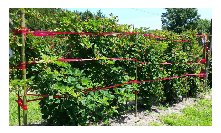
Figure 1. Blackberry subject plants of a single variety were marked to refrain customers from picking berries from which data were collected.

grower practices. Varieties evaluated were Rubus spp. 'Apache', 'Arapaho', 'Chester Thornless', 'Chickasaw', 'Kiowa', 'Natchez', 'Navaho', 'Ouachita', and 'Triple Crown'. Seven of these varieties were released by the University of Arkansas; 'Triple Crown' and 'Chester Thornless' were released by the USDA. The majority of varieties evaluated had an erect growth habit; exceptions were 'Chester Thornless', 'Natchez', and 'Triple Crown', which had a semi-erect growth habit. With the exception of 'Chickasaw' and 'Kiowa', all varieties had thornless canes. These varieties were trained on a standard T-trellis at all locations. Only 'Apache', in Mechanicsville, was trained on two trellis systems, a standard T-trellis and a rotating cross-arm trellis. At each site, data were collected on multiple plants per variety (fig. 1).