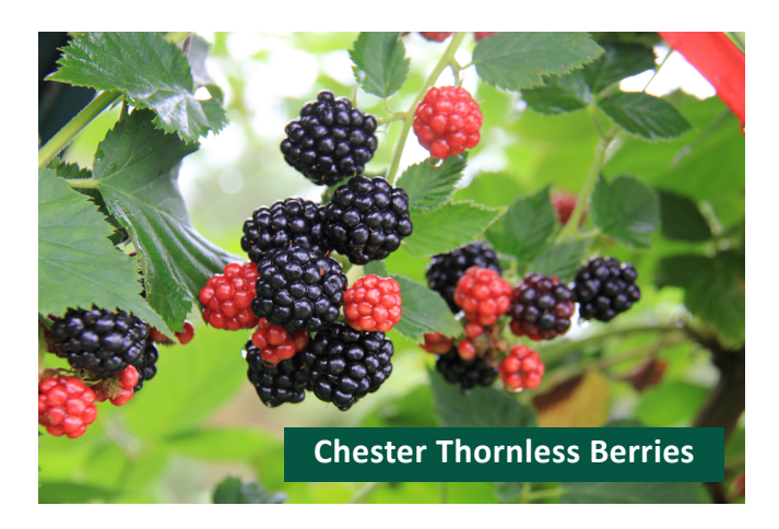
Figure 5. 'Chester Thornless' berries in various ripening stages.

There has been an increasing interest in establishing blackberries in Virginia farms. This study findings provide valuable insight, assisting growers with variety selection. For example, growers interested in high yields should consider 'Chester Thornless' (fig. 5),