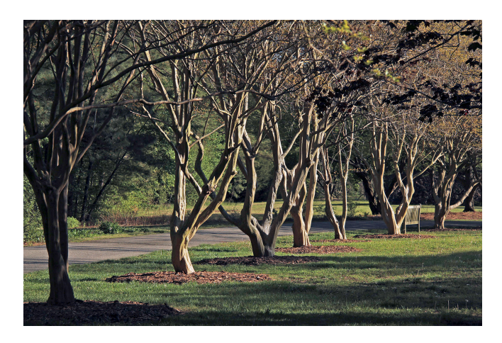
Figure 50. Crapemyrtle's beautiful form ( Lagerstroemia spp.) when pruned