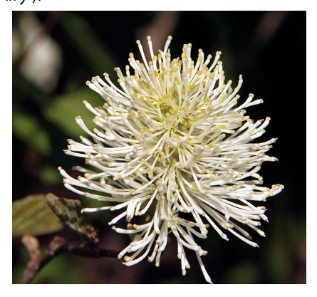
Figure 10. Mount Airy fothergilla (Fothergilla'Mount Airy') flower offers beauty in mid spring.