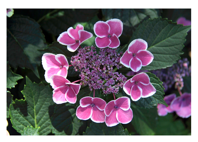
Figure 19. Lacecap flower of 'Frau Reiko' bigleaf hydrangea ( Hydrangea macrophylla 'Frau Reiko').

There are hundreds of bigleaf hydrangea cultivars that vary in flower and leaf characteristics, stem strength, hardiness, and mildew resistance. In "Hydrangeas for American Gardens," Michael A. Dirr, the world's premier woody plant expert, has a scholarly and comprehensive treatment of bigleaf hydrangea. In this pub-