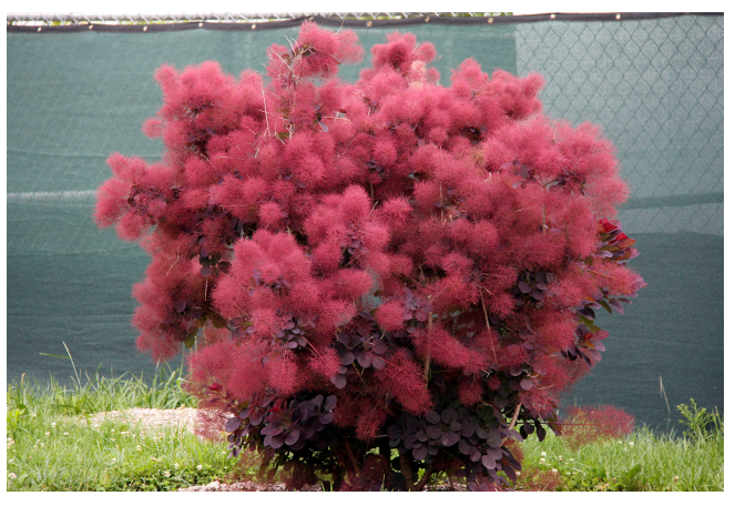
Figure 42. 'Royal Purple' smokebush ( Cotinus coggygria 'Royal Purple') produces a cloudlike display of flowers.