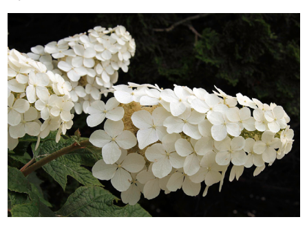
Figure 29. Flower cluster of oakleaf hydrangea (Hydrangea quercifolia).