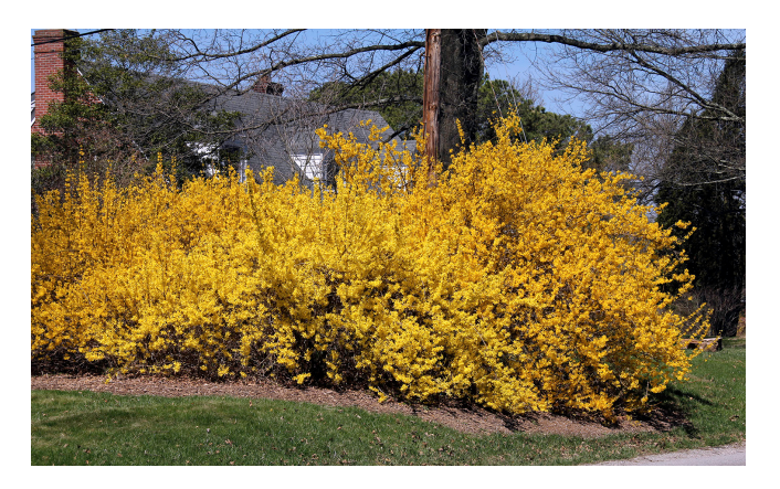
Figure 52. Border forsythia ( Forsythia × intermedia ) in flower (midspring).

Despite being quite common in landscapes and chosen for its only showy feature — yellow flowers that last for about two weeks a year — border forsythia is a rock star when in bloom (figs. 6, 52). This species is covered in bright yellow flowers (fig. 53) for about two weeks in midspring (produced on old wood) before leaves emerge. This fast-growing species tolerates poor growing conditions. To maximize the flower