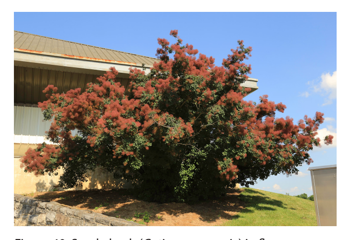
Figure 40. Smokebush (Cotinus coggygria) in flower.