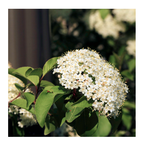
Figure 55. Close-up of blackhaw viburnum (Viburnum prunifolium) flower cluster.