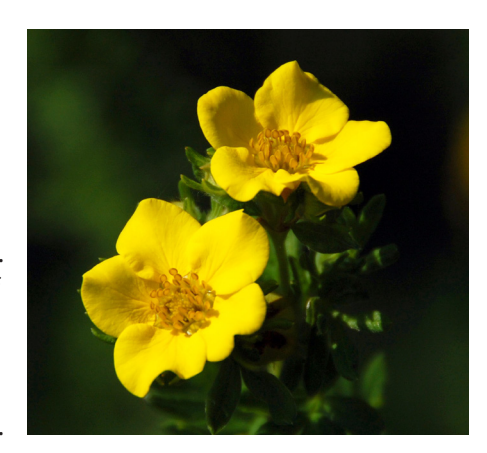
Figure 23. Close-up of bush cinquefoil (Potentilla fruticosa) flowers.

Native to the northern hemisphere, bush cinquefoil produces 1-inch yellow flowers from June until frost on new wood (fig. 23). There are numerous cultivars with orange-yellow, white, and pink flowers; double-flowered forms are also available. This slow-growing species grows in a mounded form (fig. 24). The flowers are its principal aesthetic characteristic. It will tolerate shade but the best floral display occurs in a full sun exposure. Bush cinquefoil is quite tolerant of dry soils and low temperatures.