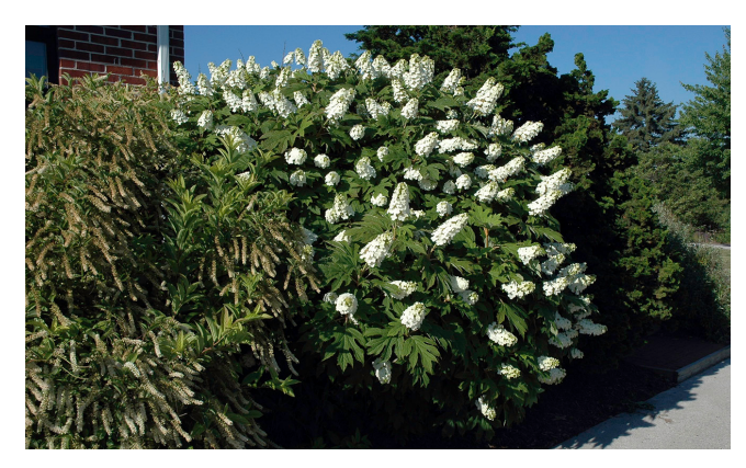
Figure 28. Oakleaf hydrangea ( Hydrangea quercifolia ) in flower (early summer).

Oakleaf hydrangea has upright branches, large oaklike leaves (with prominent lobes), and large cone-shaped white flower clusters in early summer (figs. 28, 29). The overall flower effect is quite showy. Plants flower on old wood. There are several cultivars that vary in size (from small to large), compactness, flower (single, double, or maturing to burgundy-pink), and leaf characteristics. Fall foliage color is a red-maroon and can be quite attractive (fig. 30). Stems have bark