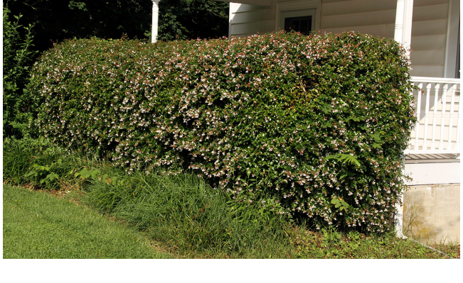
Figure 36. Glossy abelia ( Abelia × grandiflora ) in flower (as a sheared hedge).