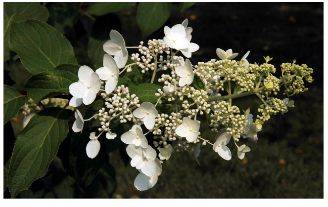
Figure 45. Flower cluster of 'Unique' panicle hydrangea ( Hydrangea paniculata 'Unique').

In the garden center trade there are numerous cultivars (30 +) of panicle hydrangea that vary in size, form, and flower characteristics. Flower characteristics include time of flowering (June to September) and flower cluster size (fig. 45). 'Grandiflora' is the patriarch of the cultivars, introduced in the 1860s, and is a large shrub/small tree form that is spectacular in flower (fig. 46). This cultivar has been described as overused and coarse, but beauty is in the eye of the beholder. 'Phantom' has especially large flower clusters. White flower clusters eventually turn brown and tend to persist on the plant, a feature that is often noted as a liability (fig. 47). This aspect can be interpreted as an attractive feature. On the plus side, panicle hydrangea is relatively easy to grow and is the toughest hydrangea for challenging site conditions. This species flowers on new wood except for the cultivar 'Praecox,' the earliest flowering cultivar (early summer); it flowers on old wood (so prune right