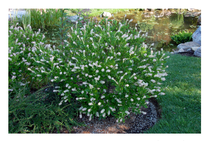
Figure 25. Summersweet clethra ( Clethra alnifolia ) in full midsummer bloom.

Summersweet clethra is cloaked in very sweetly fragrant white flower spikes in midsummer (figs. 25, 26). Flowers are so pleasantly scented that this species could be considered Mother Nature's perfume. Flowers are borne on 5-inch long bottlebrushlike flower stalks and persist for about a month. Plants flower on new wood. This species suckers readily (produces