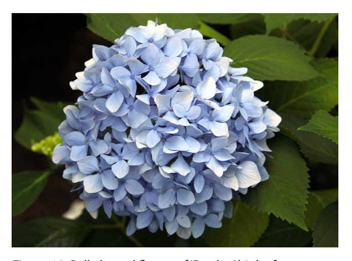
Figure 18. Ball-shaped flower of 'Dooley' bigleaf hydrangea ( Hydrangea macrophylla 'Dooley').

the overall plant texture; lacecap flowers confer a fine texture, whereas mophead types convey a bold texture.