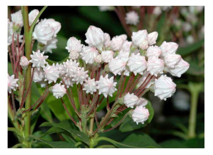
Figure 32. The difficulty of growing mountain-laurel ( Kalmia latifolia ) is offset by its beautiful flowers.

overall effect; its exquisitely beautiful flowers deserve close inspection (figs. 5, 31). The duration and beauty of the flower show in late spring is extended because the flower buds (prior to opening) are also colorful and elegantly beautiful (fig. 32). This species flowers on old wood.