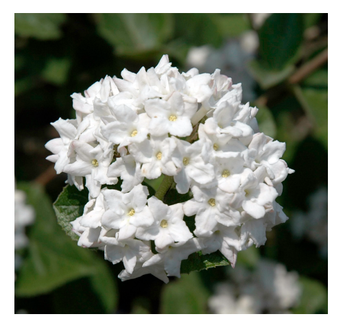
Figure 34. 'Flower cluster of 'Compactum' Koreanspice viburnum (Viburnum carlesii 'Compactum').