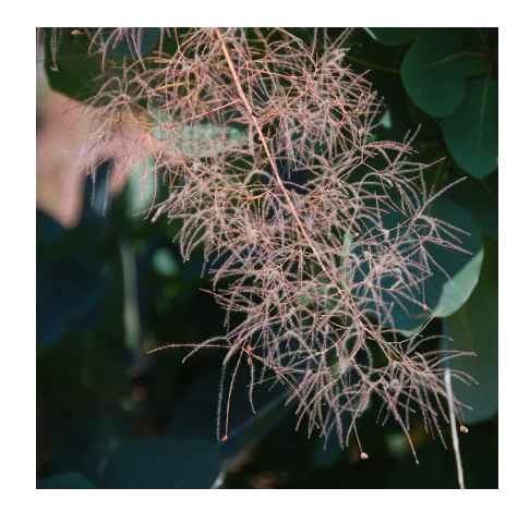
Figure 41. Close-up of plume (filaments) of smokebush (Cotinus coggygria).