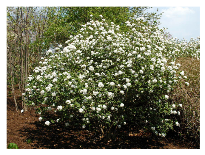
Figure 4. 'Compactum' Koreanspice viburnum ( Viburnum carlesii 'Compactum' ) in flower.

To enhance the multiseasonal appeal of your landscape, select species that flower throughout the spring and summer. Also choose species that have attractive plant features such as fruit, leaves, stem color and bark