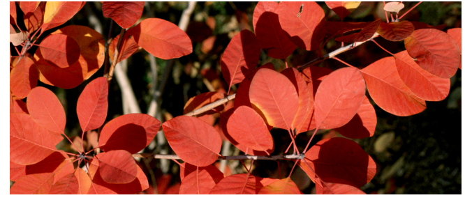
Figure 44. Showy fall foliage color of smokebush ( Cotinus coggygria ).