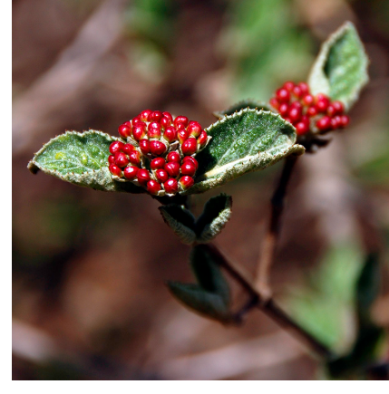
Figure 35. Showy flower buds of 'Compactum' Koreanspice viburnum (Viburnum carlesii 'Compactum').