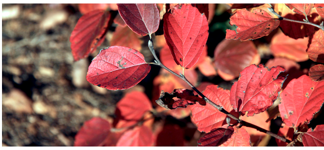
Figure 11. Outstanding fall color of Mount Airy fothergilla (Fothergilla 'Mount Airy') leaves.