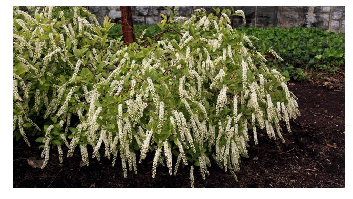
Figure 20. Virginia sweetspire ( Itea virginica ) in flower in late spring.

Virginia sweetspire has showy masses of pendulous 5-inch-long white flower spikes in early summer (figs. 20, 21). The slightly fragrant flowers are produced on last year's growth (old wood). This species has attractive, lustrous foliage that turns a beautiful, long-lasting maroon color in the fall (fig. 22). Virginia sweetspire suckers (produces shoots from root system) and over