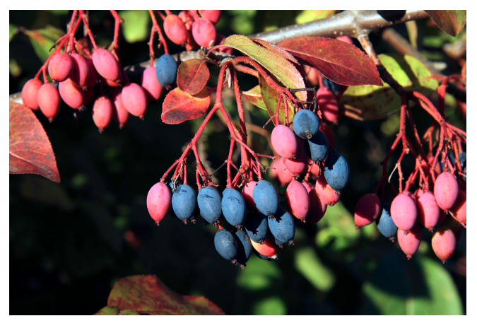
Figure 56. The attractive fruit cluster of blackhaw viburnum ( Viburnum prunifolium ) offers fall interest and food for wildlife.

and a favorite of local wildlife. The fall foliage varies from plant to plant and from fair to good with shades of red, maroon, or orange. This stiffly upright growing species is commonly found along roadsides, hillsides, and fencerows throughout the eastern U.S. Despite this ubiquity, it is rarely found in garden centers. You can special order this species through your local nursery professional or from mail order nurseries. The common name, blackhaw, is derived from the color of the fruit and its stiffly branched form that is likened to that of a hawthorn (but is not at all related to a hawthorn).