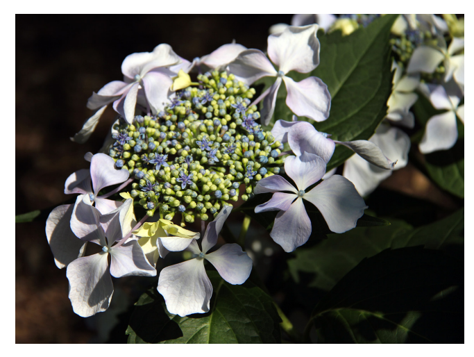
Figure 17. Lacecap flower of 'Beauté de Vendômoise' bigleaf hydrangea ( Hydrangea macrophylla 'Beauté de Vendômoise').