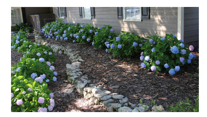
Figure 16. Spectacular flower midsummer show of Endless Summer ('Bailmer') bigleaf hydrangea in mass ( Hydrangea macrophylla Endless Summer).

Although native to Japan, bigleaf hydrangea is one of the most popular flowering shrubs in the U.S. The reason is obvious: a bigleaf hydrangea laden with large colorful flowers for weeks or months during the summer is a spectacular sight (fig. 16). Similar to the smooth hydrangea, bigleaf hydrangea has two types of very showy flowers: flat-topped flowers (lacecap type; ring of showy sterile florets surrounding an inner circle of less showy fertile flowers; fig. 17) and globe-shaped (mophead or hortensia type; sphere of mostly sterile florets; fig. 18). The choice of these flower types depends on personal preference. Flower type affects