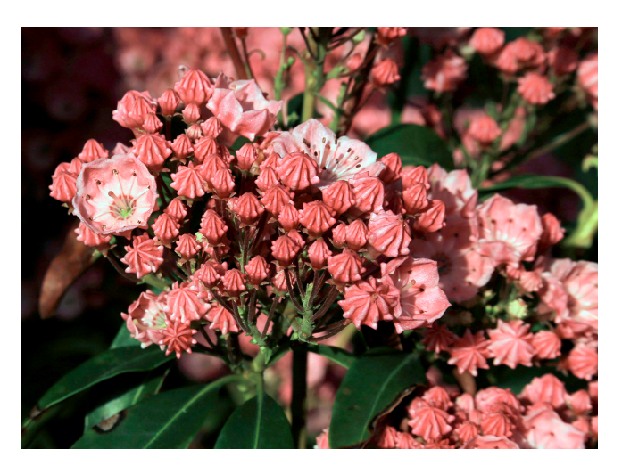
Figure 33. Flower cluster of 'Sarah' mountain-laurel ( Kalmia latifolia 'Sarah').

So, why is mountain-laurel not in everyone's garden? The reason is that the degree of its beauty is matched by the degree of difficulty in having this species thrive in man-made landscapes. There are two main cultural aspects to successfully growing this species: (1) very well-drained, loose acid soil is a must; soils with high amounts of organic matter are ideal and (2) plants also require a part shade exposure in the afternoon, especially in winter. An exception to the part shade requirement is that the author has observed plants doing quite well in full sun in mountain environments where temperature, rainfall, and soils are radically different from environmental conditions typical of most residential settings.