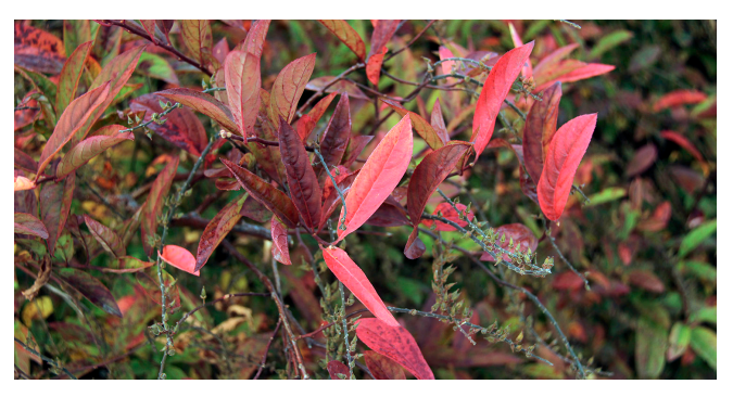
Figure 22. Showy red fall foliage of Virginia sweetspire ( Itea Virginica ).

time the mother plant will produce a colony of stems. This species is a wetland species native to the eastern U.S., but it will do fine with average moisture conditions and is shade-tolerant.