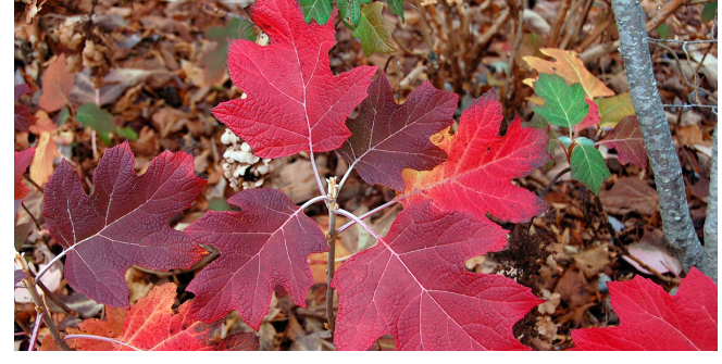
Figure 30. Showy fall foiliage color of oakleaf hydrangea ( Hydrangea quercifolia ).

that peels or exfoliates, which is an attractive feature in winter. Oakleaf hydrangea tolerates shade; however, shade-grown plants tend to have very large leaves and reduced flower production. The large, oaklike leaves impart a coarse/bold texture to the plant. Native to the southeastern U.S.