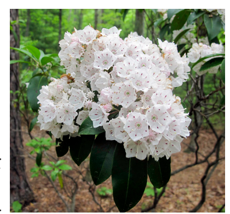
Figure 31. Flower cluster of mountain-laurel ( Kalmia latifolia ).