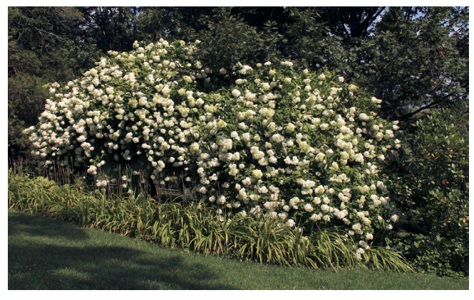
Figure 46. 'Grandiflora' panicle hydrangea ( Hydrangea paniculata 'Grandiflora') in flower (late summer).