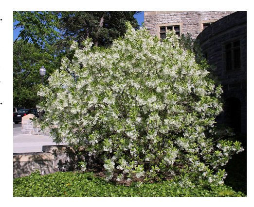
Figure 7. Shrub form of white fringetree (Chionanthus virginicus).

Plant width can vary from narrow to wide and will affect its function in the landscape. A shrub's size and