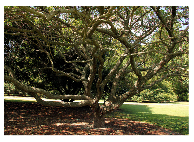
Figure 8. Small tree form of white fringetree ( Chionanthus virginicus ).

growth rate are influenced by its species characteristics and environmental conditions.