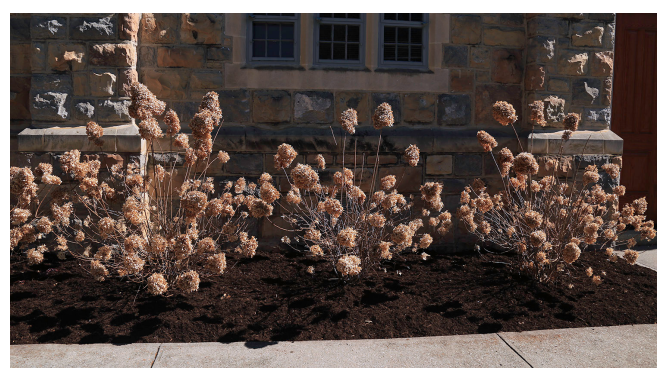
Figure 47. Persistent brown flower clusters on panicle Hydrangea ( Hydrangea paniculata ; unknown cultivar).

after flowering and not in late summer or the dormant season). Because most of the cultivars flower on new wood, they produce flowers in the summer, a period when there are relatively few woody plants in flower. A full sun exposure produces the best flower show. Native to Asia.