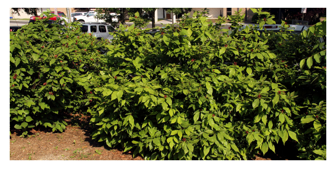
Figure 2. Common sweetshrub ( Calycanthus floridus ) in bloom, but the flowers can only be appreciated upon close inspection.