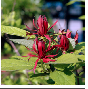
Figure 3. Close view of common sweetshrub ( Calycanthus floridus ) flowers.