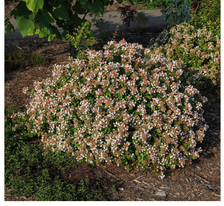
Figure 39. Compact form of 'Rose Creek' glossy abelia ( Abelia × grandiflora 'Rose Creek').