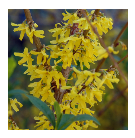
Figure 53. Close-up of border forsythia (Forsythia ×intermedia) flowers.

show, site forsythia in full and rejuvenate old plants by cutting down all of the stems to near ground level or remove the oldest/largest stems. There are several cultivars that vary in the shade of yellow for flowers, plant size, and compactness. The parents of this hybrid are native to China.