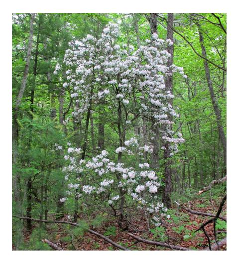
Figure 5. Mountain-laurel ( Kalmia latifolia ) in bloom in its native habitat.