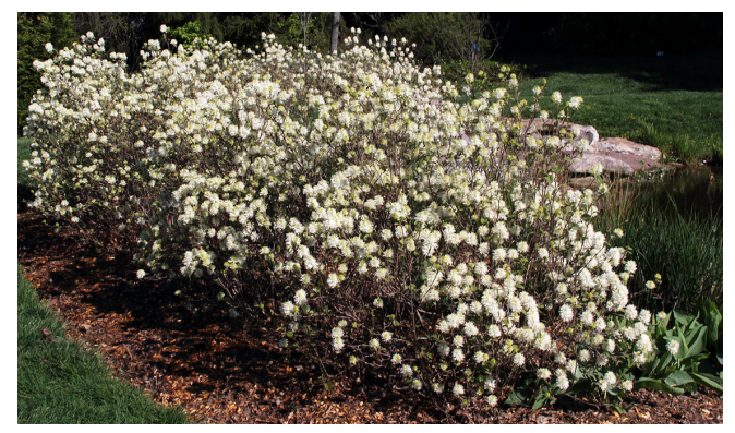
Figure 9. Showy flower display of Mount Airy fothergilla (Fothergilla 'Mount Airy').