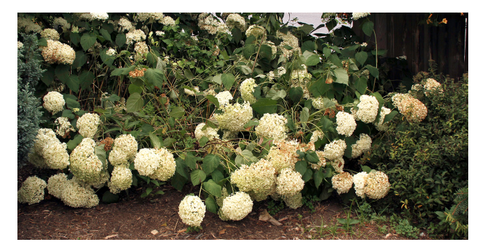
Figure 15. Floppy stems of 'Annabelle' smooth hydrangea ( Hydrangea arborescens 'Annabelle') under the weight of its flowers.