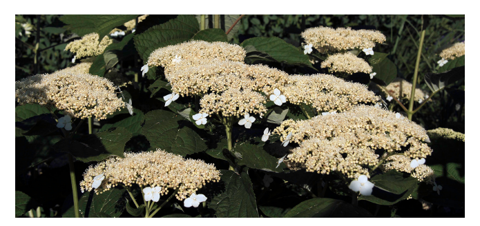
Figure 12. Lacecap flowers of 'White Dome' smooth hydrangea ( Hydrangea arborescens 'White Dome').

Smooth hydrangea produces showy, 4-inch, white flat-topped flowers (lacecap type; ring of showy sterile florets surrounding the inner circle of less showy fertile flowers) in late spring/early summer that persist for about a month; some cultivars bloom into July (figs. 12, 13). There are a few clones that have large (up to 10+ inches wide) globe-shaped (mophead type; sphere of mostly sterile florets) flowers with 'Annabelle' (fig. 14) and Incrediball ('Abetwo') being some of the more popular forms in the trade. Clones with spherical flowers are quite showy due to the abundance of large-size