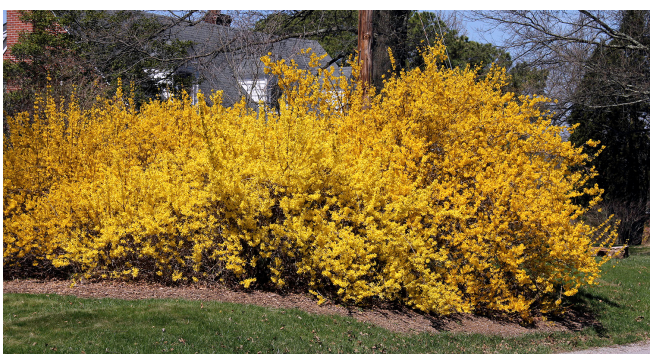
Figure 6. Border forsythia ( Forsythia × intermedia ) in flower (midspring).

features, texture, or shape that can provide showiness during nonflowering times.