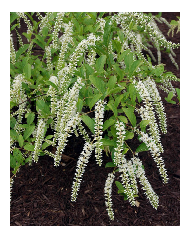
Figure 21. Close-up of Virginia sweetspire ( Itea virginica ) flowers.