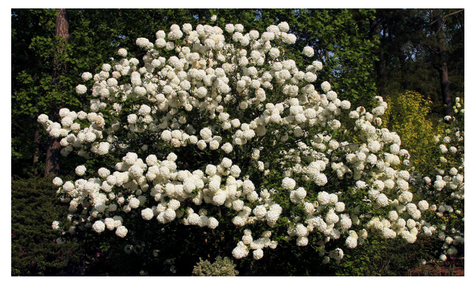
Figure 1. Chinese snowball viburnum ( Viburnum macrocephalum ) with an impressive display of flowers (mid-to late spring).

fig. 1) are covered in large flowers, creating a major impact when viewed at a distance. Other shrubs such as common sweetshrub ( Calycanthus floridus ; fig. 2) have fewer flowers and require a close proximity for flowers to be appreciated (fig. 3). Individual flowers may be just as attractive, or even more appealing, as