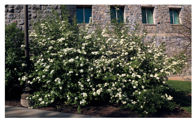
Figure 54. Blackhaw viburnum ( Viburnum prunifolium ) in flower (late spring).

Blackhaw viburnum is another native of the eastern U.S. that has a relatively showy flower display in midspring (figs. 54, 55). However, when compared to some of the common landscape viburnums, such as bigleaf hydrangea (fig. 16), this species may only be deemed moderately showy. Blackhaw viburnum makes up for this apparent inferiority by its fruit and fall foliage show as well as its tolerance for poor soils and drought. In late summer, about 1/3-inch eggshaped fruits briefly turn a charming pink color before turning blue-black (fig. 56). While marginally showy dressed in the dark color, they are edible by humans