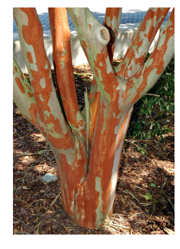
Figure 51. Stunning, exfoliating bark of 'Natchez' crapemyrtle (Lagerstroemia 'Natchez').

be produced for most of the summer (depending on cultivar). Adding to its appeal are a beautiful form (fig. 50), very handsome bark (some smooth and some exfoliating; shades of white, tan, and cinnamon-brown bark; fig. 51), its tolerance of poor soils and legendary heat and drought tolerance, and showy fall foliage color. Crapemyrtle, minus a few shortcomings, is a superstar in the landscape!