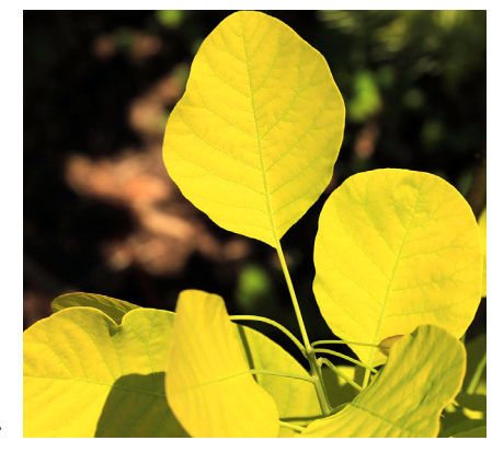
Figure 43. Yellow foliage of Golden Spirit ('Ancot') smokebush ( Cotinus coggygria Golden Spirit).