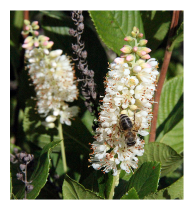
Figure 26. Close-up view of summersweet clethra ( Clethra alnifolia ) flowers.