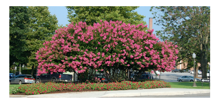
Figure 48. Crapemyrtle ( Lagerstroemia spp.; unknown cultivar) in flower.

The flower display of crapemyrtles is one of the showiest of all flowering shrubs (fig. 48). The reason for this is that (1) flower colors include shades of red, pink, lavender, rose, fuchsia, purple, and white (fig. 49); and (2) flower clusters (up to 8 inches long) can