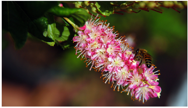
Figure 27. Pink flowers of 'Ruby Spice' summersweet clethra ( Clethra alnifolia 'Ruby Spice').

shoots from the roots), so over time it forms a colony of plants originating from the mother. It tolerates shade and is a wetland species, yet it grows well in most acid soils except for soils that tend to be dry. The species has a natural, informal appearance that may not be suitable for some landscapes. The cultivars 'Compacta' and 'Hummingbird' have a smaller, compact form and lend themselves to a formal landscape. In addition to plant size/habit, other cultivars have been selected for foliage characteristics, flower size and color (fig. 27), and time of flowering. Native to the eastern U.S.