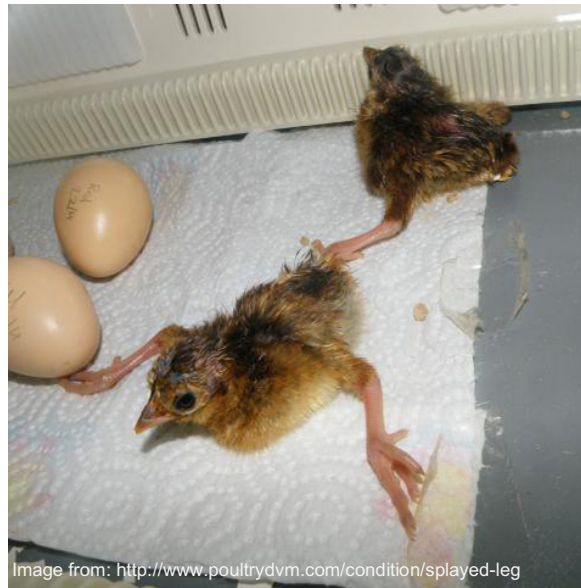
Straddled or splayed legs in chicks

The biggest problem with slippery surfaces is straddled legs or splayed legs. Once the fowl gets to this point as shown below, the problem is nearly impossible to correct, although some home remedies are discussed on the internet.