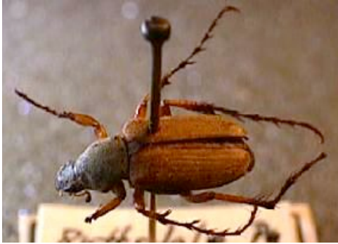
Fig. 1: Rose Chafer beetle.

DESCRIPTION: Gray or fawn colored beetle with a reddish-brown head. It is long legged and slender, 1/2 inch long.