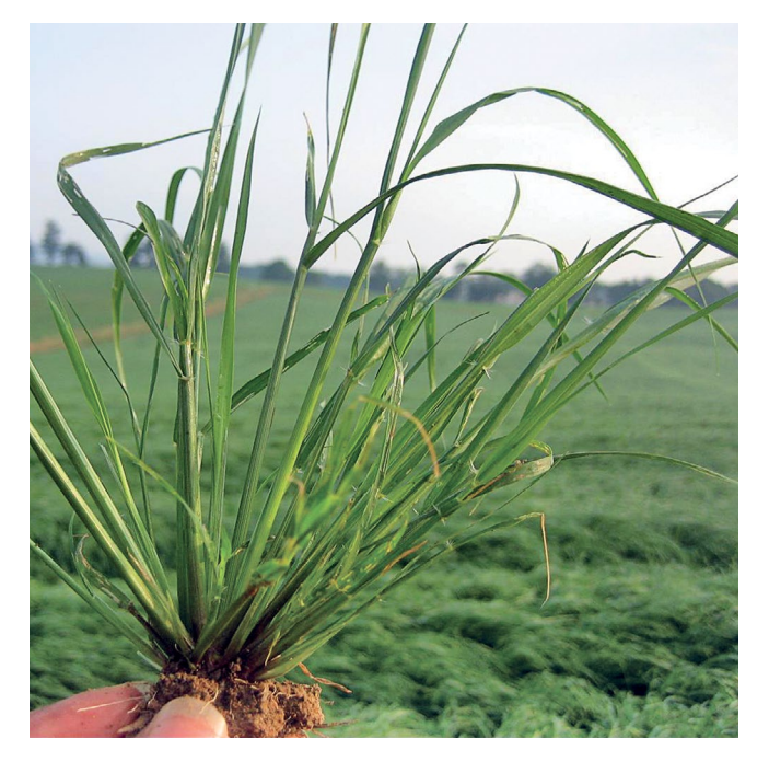
Figure 4. Teff has many tillers and a large root system once established (bottom). More typically grown for hay (top), the grass can be grazed with appropriate management that allows the root system to get large enough (middle).

do not crack extensively. Crabgrass is less productive on clays, silts, and silty-clay loams. In most cases, a pH range of 6 to 6.5 should be targeted for crabgrass, as optimum growth occurs at a slightly acidic pH. Teff is the best-suited of these forages to marginal and heavy soils. The grass grows successfully on soils with low pH and poor fertility and performs better on heavy clays than on loamy or sandy soils.