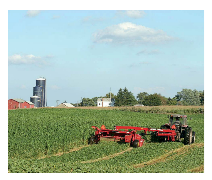
Figure 1. Warm-season grasses can fill summer production gaps for a variety of animals and with a variety of methods. Dairy cows graze forage sorghum (bottom right) and horses graze young forage millet plants (top right). These forages also can be grown for baleage, silage, and sometimes hay (top left).

The same features that provide these benefits – tall form, rapid growth, and abundant biomass production – also can present challenges. Without proper management, many warm-season forages can