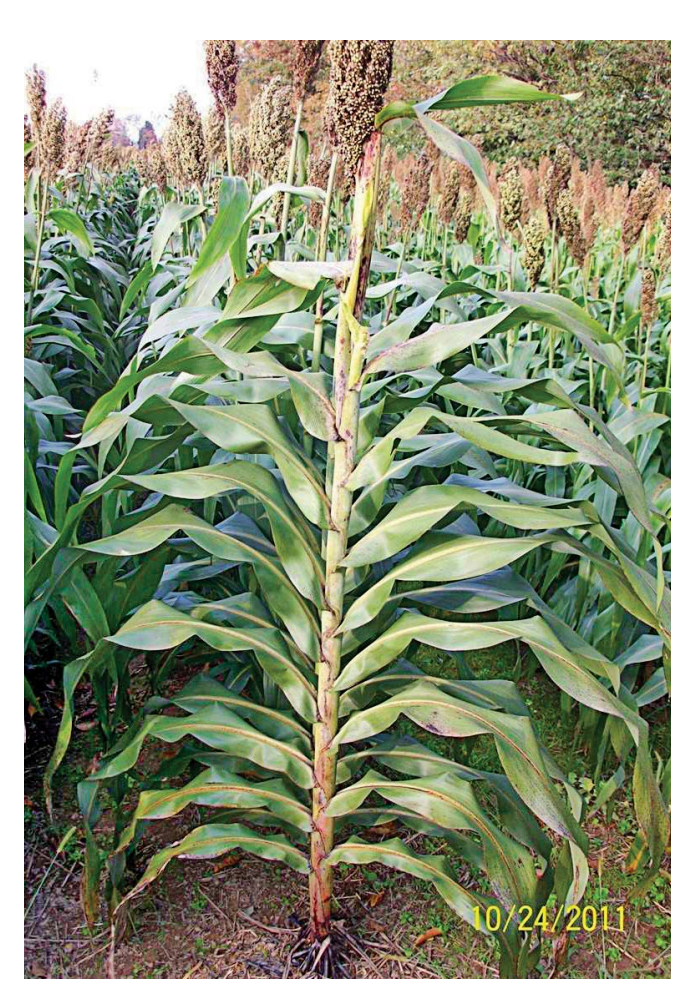
Figure 2. Brachytic-type warm-season forages have shorter internodes between leaves on the plant. This reduces the amount of less-digestible stem. Yields can be maintained by harvesting lower to the ground, and the shorter plant resists lodging.

because the internodes – the section of stalk between leaves – are shorter than on traditional sorghums. Leaf and grain yields are similar for both types, and dwarf types can support similar yields by tolerating a lower cutting height. They are very resistant to lodging as the grain head has less leverage on the shorter stalks.