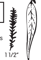
2" - 6"