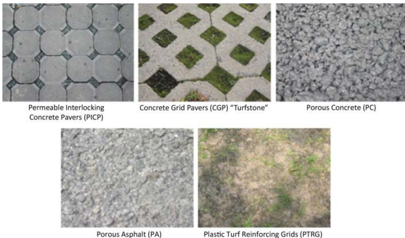
Figure 1. Examples of permeable pavement applications.

Often downspouts from home gutters connect into underground pipes that run directly into stormwater drains. Simply unhooking your downspouts from the storm drain system can significantly reduce the amount of runoff from your site. When possible, it is best to redirect these downspouts away from the house and toward grassy areas or other areas with high permeability, allowing water infiltration (figure 2).