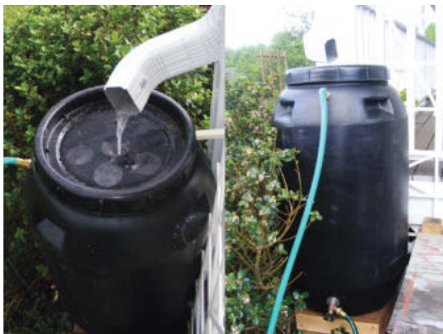
Figure 3. A rain barrel system for rainwater harvesting.