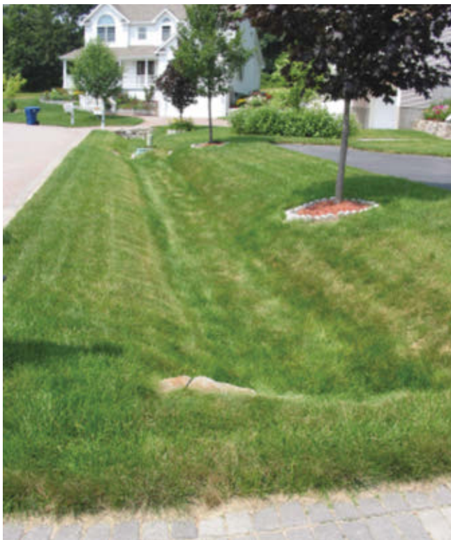
Figure 7. An example of a grass swale in a residential application.