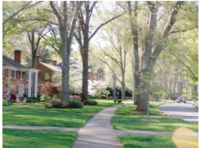
Figure 5. An example of urban trees.

Rain gardens are depressions planted with annual and perennial plants that serve to collect rainwater from nearby impervious surfaces, allowing infiltration of water that would otherwise be runoff (figure 6). These areas provide an attractive area to detain a significant volume of rainfall and allow that water to infiltrate slowly into the ground. Often, downspouts can be directed into rain gardens, and these areas are capable