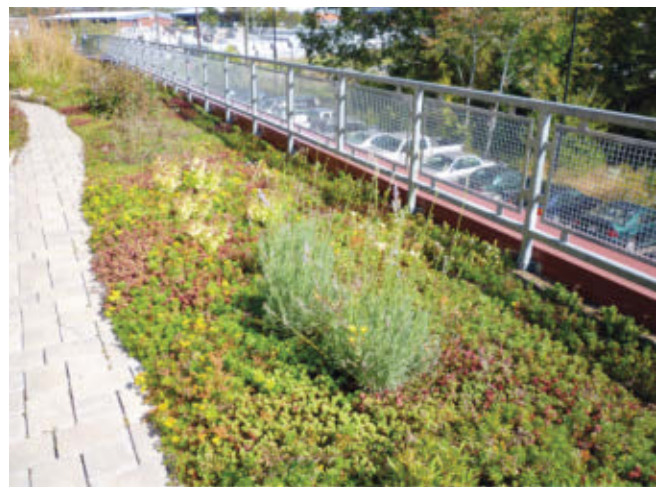
Figure 4. A green roof application.