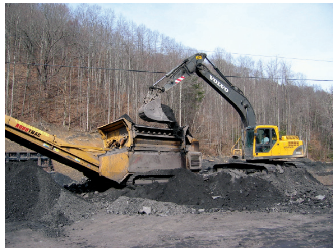
Figure 9. Reprocessing and removing older refuse materials, including pre-SMCRA abandoned mine land piles, is becoming increasingly common in southwestern Virginia, both for the purpose of salvaging marketable coals and for environmental remediation. When the surface materials of these older piles are sufficiently weathered to enable them to support vegetation, separating and retaining these materials for use in reclamation can save money and it can reduce or eliminate the environmental disturbance required to obtain soil cover that otherwise would be needed to restore the area.

When checking refuse properties, be aware of the potential for elevated temperatures inside the pile. If high temperatures are observed, notify the Virginia Division of Mined Land Reclamation immediately. Although spontaneous combustion of coal refuse rarely occurs, it sometimes happens. At least one fire in a Virginia abandoned mine land (AML) refuse pile occurred when the surface material was disturbed in advance of potential reprocessing, allowing atmospheric oxygen to access the pile interior where elevated temperatures had built up due to precombustion oxidation processes. The vast majority of Virginia coal refuse piles do not suffer from this condition but caution is warranted because of the few that do. Coal refuse materials containing significant quantities of combustible carbon should not be used for direct-seeding due to the potential for accidental combustion that may be caused by lightning, vandalism, or other means.