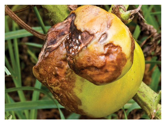
Figure 7. Oily, brown/copper-colored, sunken lesions of late blight on green tomato.