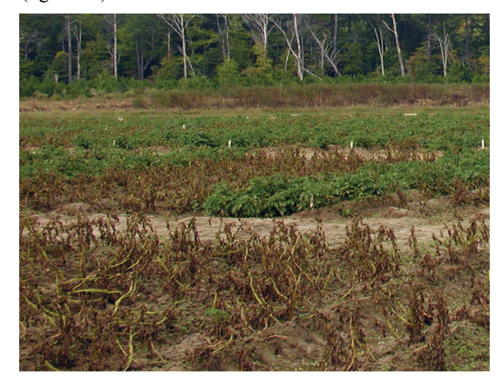
Figure 14. A commercial potato field in the Eastern Shore of Virginia that experienced progressive devastation from the late blight pathogen.

If infected tutbers are placed in cool, dry storage, disease progression slows or stops and lesions become dry. However, the disease is not eliminated, and P. infestans can resume growth and sporulation when environmental conditions become favorable again. Diseased tubers are prone to invasion by secondary decay organisms that can cause various tuber rots. As with tomato, when wet and cool conditions are prevalent, the disease typically progresses rapidly through the plant canopy and crop (figure 14).