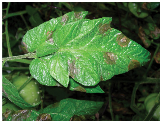
Figure 3. A tomato leaf with the first symptoms of late blight; these typically appear on the leaves as water-soaked, oily, pale or dark green or brown/black, circular or irregular lesions.

Late blight affects all aboveground parts of the tomato plant. The first symptoms usually appear on leaves as water-soaked, oily, pale or dark-green or brown/black, circular or irregular lesions (figure 3). Typically, younger, more succulent, tissue is affected first (figure 4). During periods of abundant moisture, sporulation of the pathogen can be seen by the naked eye as a white, cottony growth on the underside of affected leaves and/ or on fruit lesions (figure 5).