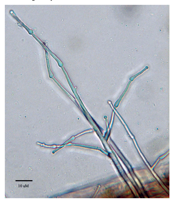
Figure 2. Sporangiophores of Phytophthora infestans from which all sporangia have been dislodged on tomato leaf tissue. Note the characteristic swellings on the ends of the sporangiophores.

The ability to rapidly produce sporangia under favorable environmental conditions is the basis for the epidemic potential of P. infestans . Sporangiophores of P. infestans are hyaline (clear) and branched with characteristic swollen ends where the lemon-shaped sporangia are produced (figure 2). The sporangia are easily dislodged from the sporangiophores by air currents, mechanical force, and/or splashing water. They are well-adapted for long-distance transport in wind currents to new locations miles away or for splash dispersal from diseased plant tissue onto new tissue or soil where they may release hundreds of infective, swimming zoospores.