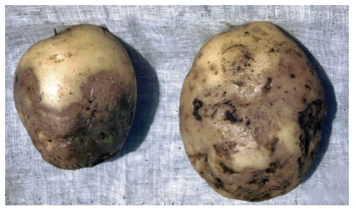
Figure 12. Brownish, irregular lesions on potato with late blight.