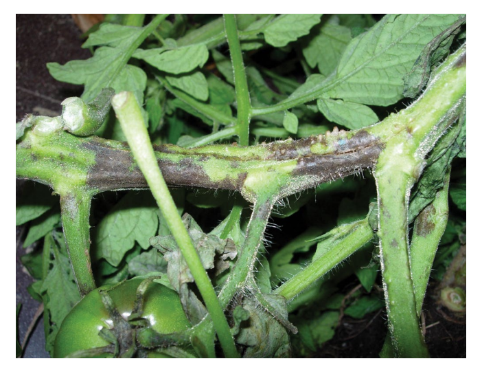
Figure 10. Dark, oily lesions of Phytophthora infestans on the stems of a tomato plant.