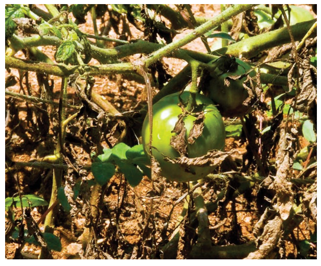
Figure 6. Under cool, moist conditions, late blight progressed rapidly through this tomato crop, leaving brown and withered foliage.

When wet and cool conditions are prevalent, the disease usually progresses rapidly through the plant canopy and crop, resulting in brown, shriveled foliage (figure 6). Both green and ripe tomatoes are susceptible to severe injury from late blight. Oily, brown/copper in color, and often-sunken lesions form on both green and ripe fruits, which may remain firm (figure 7). Lesions may spread over the surface of the tomato, and secondary decay organisms generally follow the late blight infection, causing various fruit rots (figure 8).