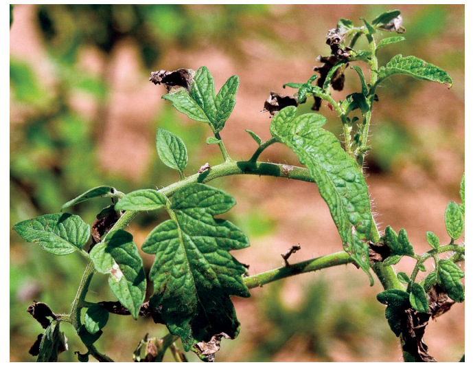
Figure 4. Young, succulent leaf tissue is typically first affected by the late blight pathogen.