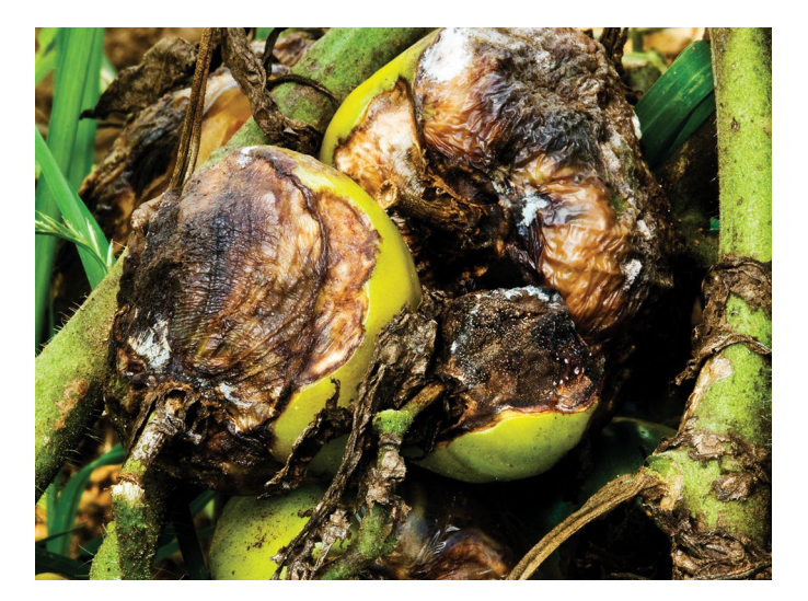
Figure 8. Late blight lesions on tomatoes that have been further colonized by secondary decay organisms, which cause additional fruit rot.

Often, the stem end of the fruit is affected first (figure 9), because spores tend to land on the top of fruit and small cracks favor infection by the pathogen; however, this is not always the case. Petioles and stems also develop dark, oily lesions (figure 10). The odor from rotting, late-blight-diseased plants and fruits is characteristically foul.