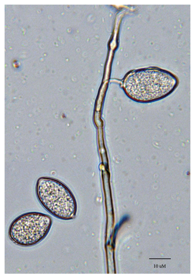
Figure 1. One lemon-shaped sporangium (zoosporecontaining structure) of Phytophthora infestans on a sporangiophore and two sporangia that have been dislodged.

Phytophthora infestans produces motile spores called "zoospores." Zoospores are chemically attracted to plant tissue and able to swim through water (e.g., in soil, drainage ditches, etc.) toward plant tissue where they form an infective cyst. This characteristic has practical implications because P. infestans rapidly produces abundant sporangia (lemon-shaped, zoospore-containing structures) on host tissue during wet, cool weather (figure 1).