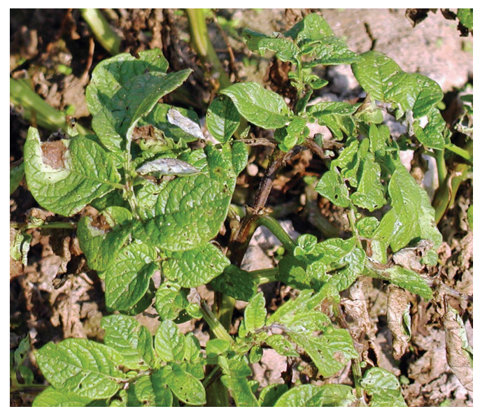
Figure 11. Blighted leaves, petiole, and stem lesions on potato.

Leaf, petiole, and stem symptoms on potato are similar to those described above for tomato (figure 11). On tubers, copper/brown, irregular lesions form and cause a dry, firm rot (figure 12). Beneath the skin, the flesh is discolored and grainy (figure 13). Tuber rot may extend about 1 inch or less into the tuber when soil conditions are dry, but in wet soil conditions, tuber decay progresses rapidly and tubers may rot completely.