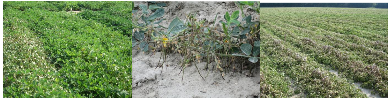
Examples of effects by drought and heat: vine drying (left), pegs not entering the ground (center), and spider mite infestation (right).