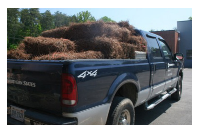
Figure 5. Pine straw markets are developing in the Southeast where needles of suitable length (longleaf or perhaps loblolly) can be harvested with a minimum of twigs and cones.