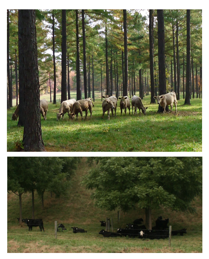
Figure 4. Top, a loblolly pine stand was thinned and forages were established to create a silvopasture in Virginia's Southern Piedmont. Bottom, these 17-year-old black walnut trees were originally planted 8 feet apart within rows, with rows planted 40 feet apart in Virginia's Ridge/Valley region. The trees were thinned once before this photo. A final thinning will be made to create a 40-foot by 40-foot spacing.

As hinted at, the term silvopasture implies actively managed tree-forage-livestock systems. In this regard, each component is actively managed (fig. 4). Silvopasture systems can be created by planting trees in pastures or by establishing forages under thinned trees. Each of these approaches has unique demands and opportunities, but in both cases, system management follows the "four-'i' "agroforestry principle. That is, silvopasture management at its best is intentional, intensive, integrated, and interactive.