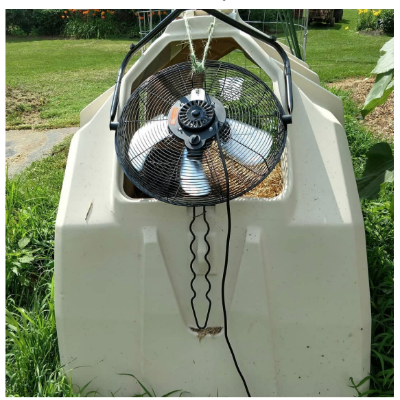
Figure 2. Calf hutch with attached fan.

for calves. Also, try to reduce any other outside stressors such as vaccination or disbudding during the hottest times of the day.