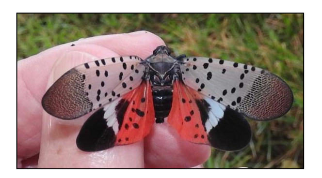
Figure 1. Adult spotted lanternfly.

Spotted lanternfly (SLF; Fig. 1) was first detected in Frederick County in northern Virginia in January 2018. SLF is native to China, where it has been documented in detail dating as far back as the 12th century. It is also found in India, Japan, Korea, and Vietnam. The range in Virginia now includes the entire Shenandoah Valley and parts of the Piedmont. Researchers believe SLF likely arrived from China on shipping materials, possibly two years earlier than when it was first detected.