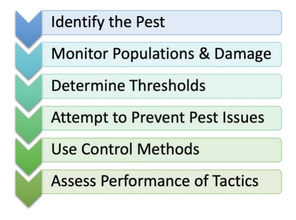
Figure 1. The components of an IPM program.

IPM is a holistic, ecological approach to controlling pests. In an IPM program, the pest situation is assessed before taking action. The first step is to identify the pest to determine biological information, such as the pest's habitat and life cycle. Once this information is gathered and evaluated, it can be used to develop a pest management plan. IPM uses an assortment of control methods and employs the best practices available to protect people, animals, and the environment.