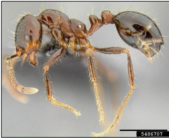
Figure 3. Adult black imported fire ant.