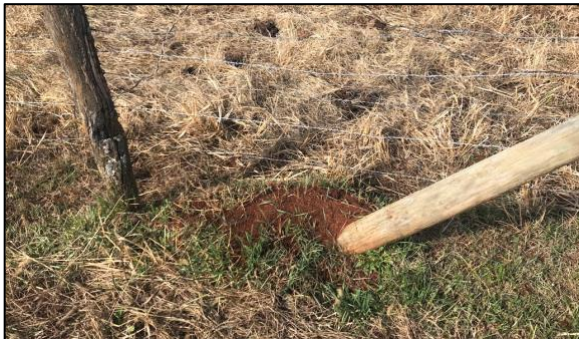
Figure 6. Hybrid fire ant mound at the base of a support pole along a fence in Lee County, VA (E. Day, Virginia Tech).

Imported fire ant colonies do not always form large mounds. Their mounds can range from nearly flat to almost 0.46-0.61 m (18-24") tall. Young colonies may make small mounds until the colony is older with enough larger worker ants to build larger mounds. Soil type can influence mounds as well, with lower or flatter mounds in sandy soil and taller mounds in clay soils. During cold weather, the colony retreats deep in the ground and may not actively enlarge their mound until warmer weather returns.