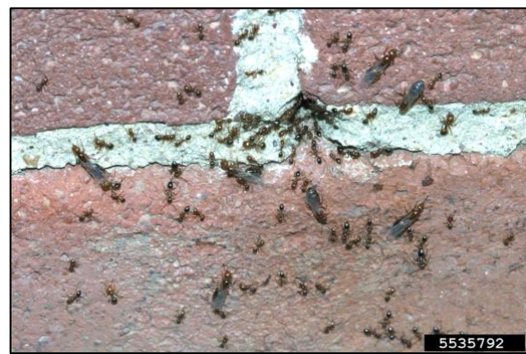
Figure 8. Fire ants emerging between bricks.