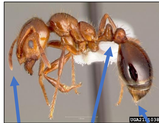
antennal club 2 segmented waist stinger

Imported fire ants range in color from reddish-brown in RIFA (Fig. 2) to a darker brown in BIFA (Fig. 3). Depending on their genetics, hybrid fire ants can vary between reddish-brown and dark brown, with a wide range of variation found among members of the same colony.