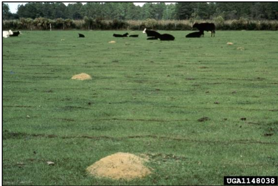
Figure 5. Fire ant mounds in a cattle pasture.

parcs, flower beds, cemeteries, and lawns (Fig. 7) that are not heavily shaded. They nest inside houses, buildings, and sometimes vehicles. Fire ants are often found near building foundations (Fig. 8), concrete structures, or rock walls where solar radiation helps keep the colony warm. In addition, fire ants may nest in air conditioners, water pumps, switch boxes, transformers, and other electrical housings.