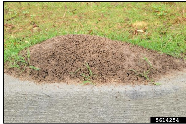
Figure 7. Fire ant mound along a curb.

Imported fire ant colonies do not always form large mounds. Their mounds can range from nearly flat to almost 0.46-0.61 m (18-24") tall. Young colonies may make small mounds until the colony is older with enough larger worker ants to build larger mounds. Soil type can influence mounds as well, with lower or flatter mounds in sandy soil and taller mounds in clay soils. During cold weather, the colony retreats deep in the ground and may not actively enlarge their mound until warmer weather returns.