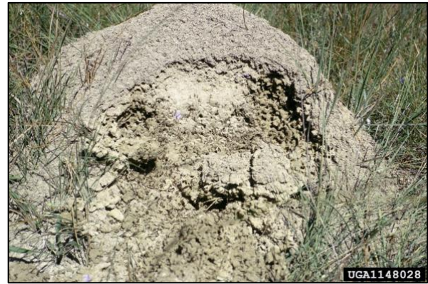
Figure 4. Large fire ant mound in field.

Around the farm, large fire ant mounds can damage agricultural equipment in the field, particularly in areas with heavy soils (Fig. 4). Fire ants may damage irrigation tubing when seeking water sources in dry weather. They are attracted to electrical equipment and may damage it by stripping wires and shorting out circuitry.