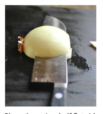
Place the onion-half flat side down. Place a flat hand on the onion, palm side down, to hold it in place. With the other hand, cut the onion horizontaly toward the root by rocking the knife into the onion. Do not cut the onion into two pieces; leave about a half inch of uncut onion at the root end. Repeat this step so that there are two horizontal slices in the onion.