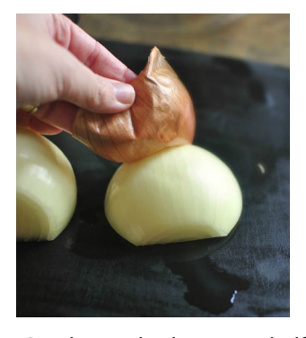
Cut the washed onion in half. Cut the ends off from the opposite side of the roots. Leave the roots in tact.