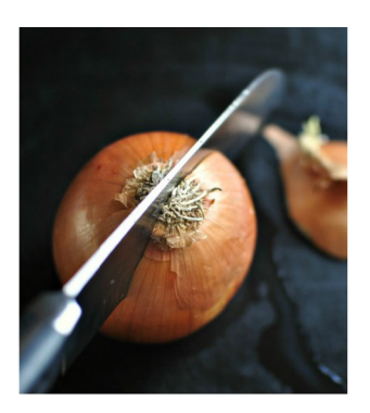
Peel the outer layer of the onion until all of the brown layers are removed.