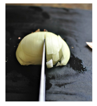
Slice the onion vertically and perpendicular to the roots. Leave about a half inch of uncut onion at the root end.