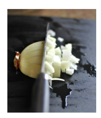
Dice the onion by cutting vertically and parallel to the root end. Chop any larger uncut pieces.