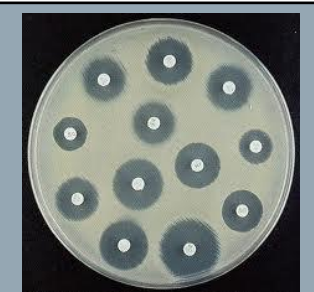
Kirby Bauer Test After spreading the sample, discs containing different antibiotics are gently placed on the surface of the media. The clearings around the discs are where bacteria in the sample could not grow because of the antibiotic.

The bacterial DNA can also be studied in order to search directly for ARGs. Researchers can directly isolate bacterial DNA from manure, soil, water, and other environmental samples. They can then compare the DNA to databases used by researchers all around the world in order to determine what kinds of ARGs may be present. This method is known as metagenomics . As of now, there are