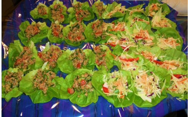
Restaurants are often looking for crops that can be used for turning the ordinary into something eye-catching, appealing, and tasty! A great example is hydroponicallygrown Bibb lettuce used as a sandwich "wrap".