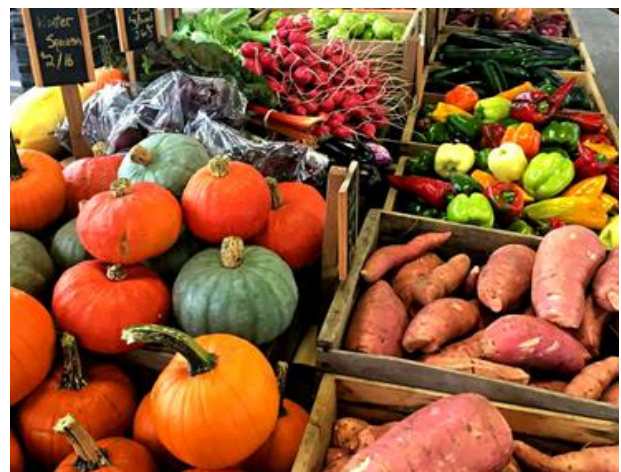
Photo: Radell Shrock (Season's Bounty Farm, Harrisonburg, Virginia)

But what does this look like? Local food networks utilize local supply chains such as direct market sales to consumers through CSAs, agritourism, farmers markets, farm stands, and other alternative outlets (see below). Additionally, the direct market sector offers feedback far more quickly than most other sectors, and is therefore a great choice for any beginning growers looking to get their feet wet and experiment. It's important to note, however, that as food safety laws continue to develop along with the general public's concerns with food safety, it is profoundly important that the local growers intending on selling directly in this sector familiarize themselves with current food safety practices, laws, and regulations.