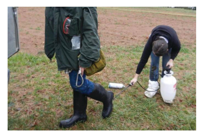
Figure 3. Clean and sanitize boots between hoop houses or display blocks.