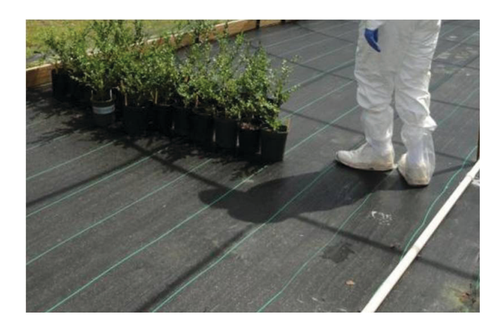
Figure 2. Store plants on easy-to-clean surface such as weed mat over well drained gravel.

I. Locate unloading zone on a surface that can be easily swept and cleaned between deliveries.