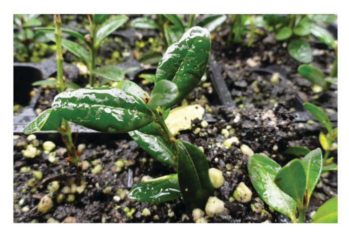
Figure 5. When using overhead irrigation, water plants so as to reduce leaf wetness period.

boxwood blight; only partial resistance is available. Contact your local county Extension office for a list of the more resistant cultivars.