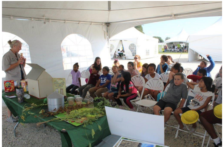
Accomack County Public School third graders learn about soybean production at Farm Tour Day.