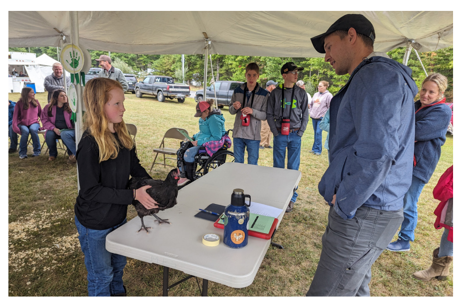
A Poultry Chain participant displays a hen to the judge in the annual Bath 4-H Poultry Show.